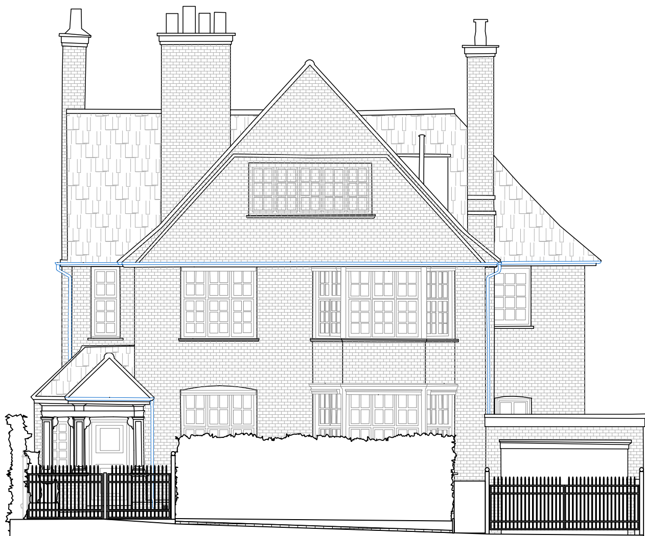
Elevation Existing Front Garden (undertaken 18th January 2019)

From the road the overall appearance of the house and drive will be little changed.