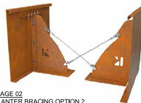
IMAGE 02 PLANTER BRACING OPTION 2 BY KINLEY