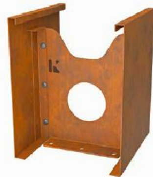
IMAGE 01 PLANTER BRACING OPTION 1