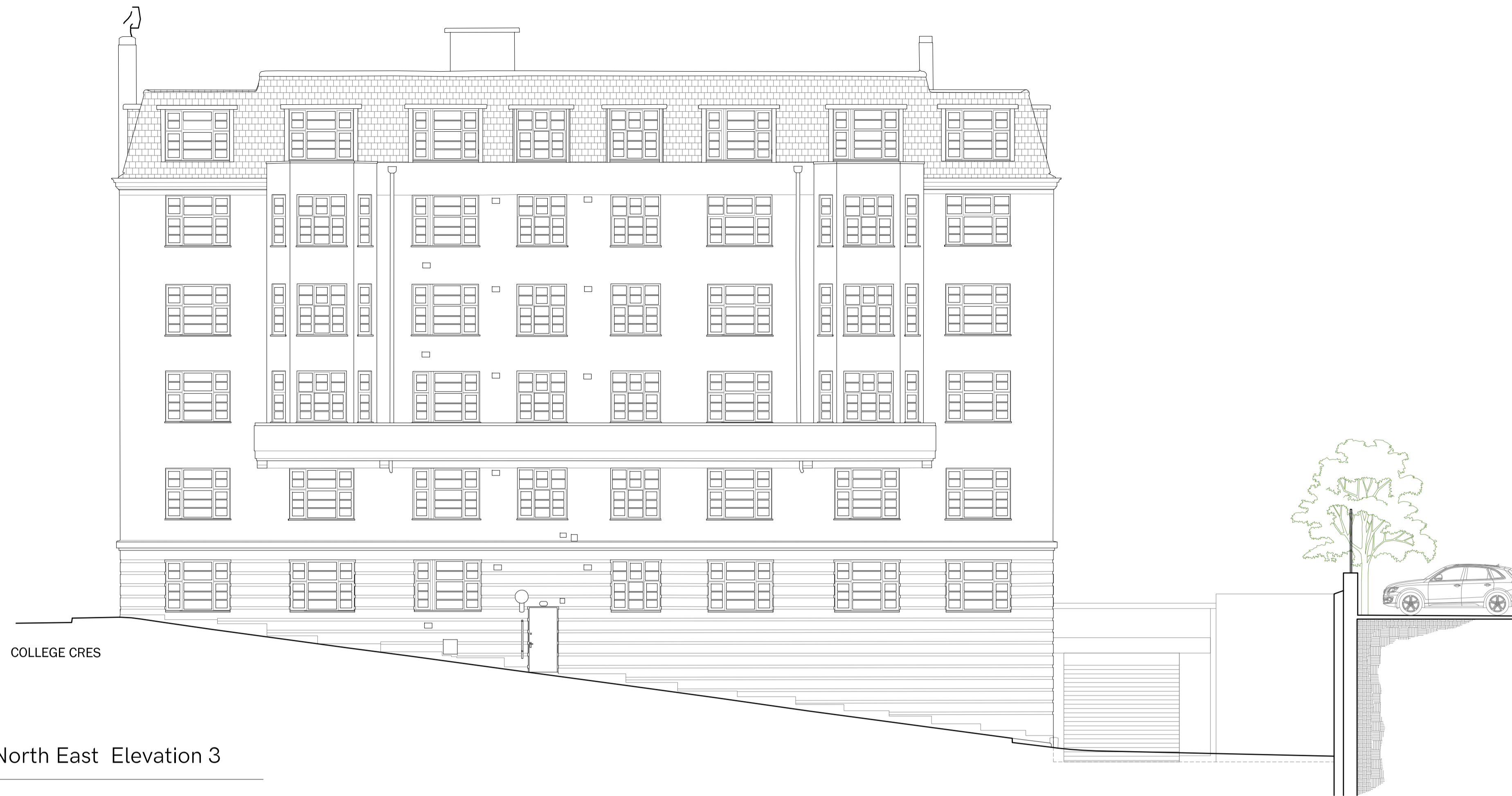
Existing North East Elevation 3