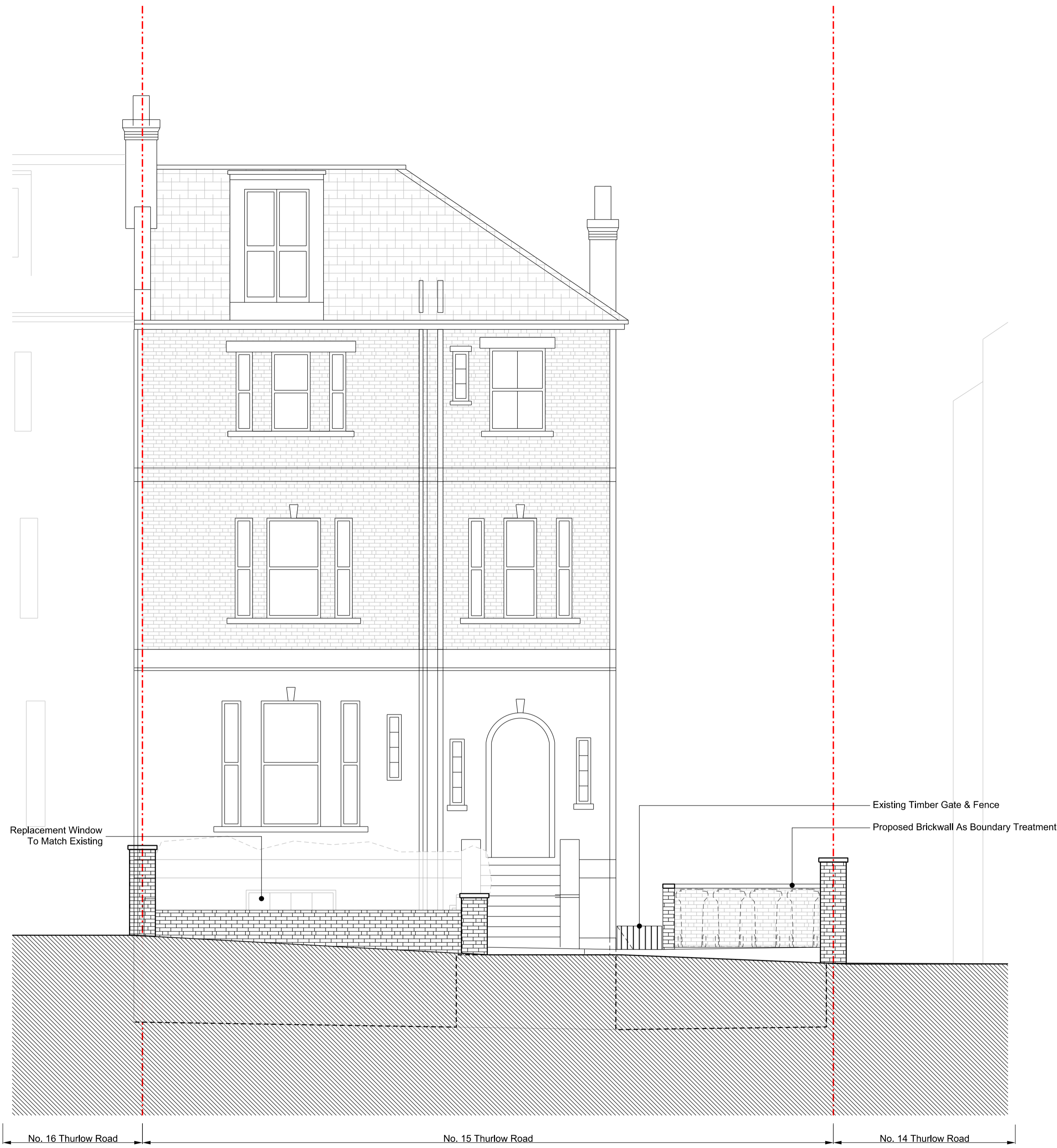
01 PROPOSED: FRONT ELEVATION