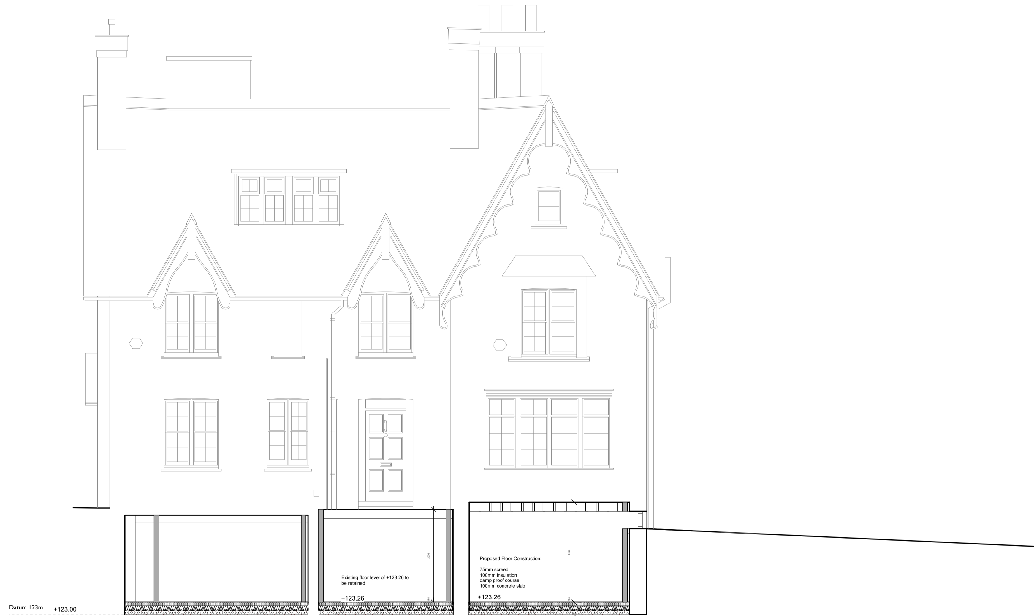
Proposed Basement Section

Revision Date B 14/01/2020 Tree trunk info re-attached