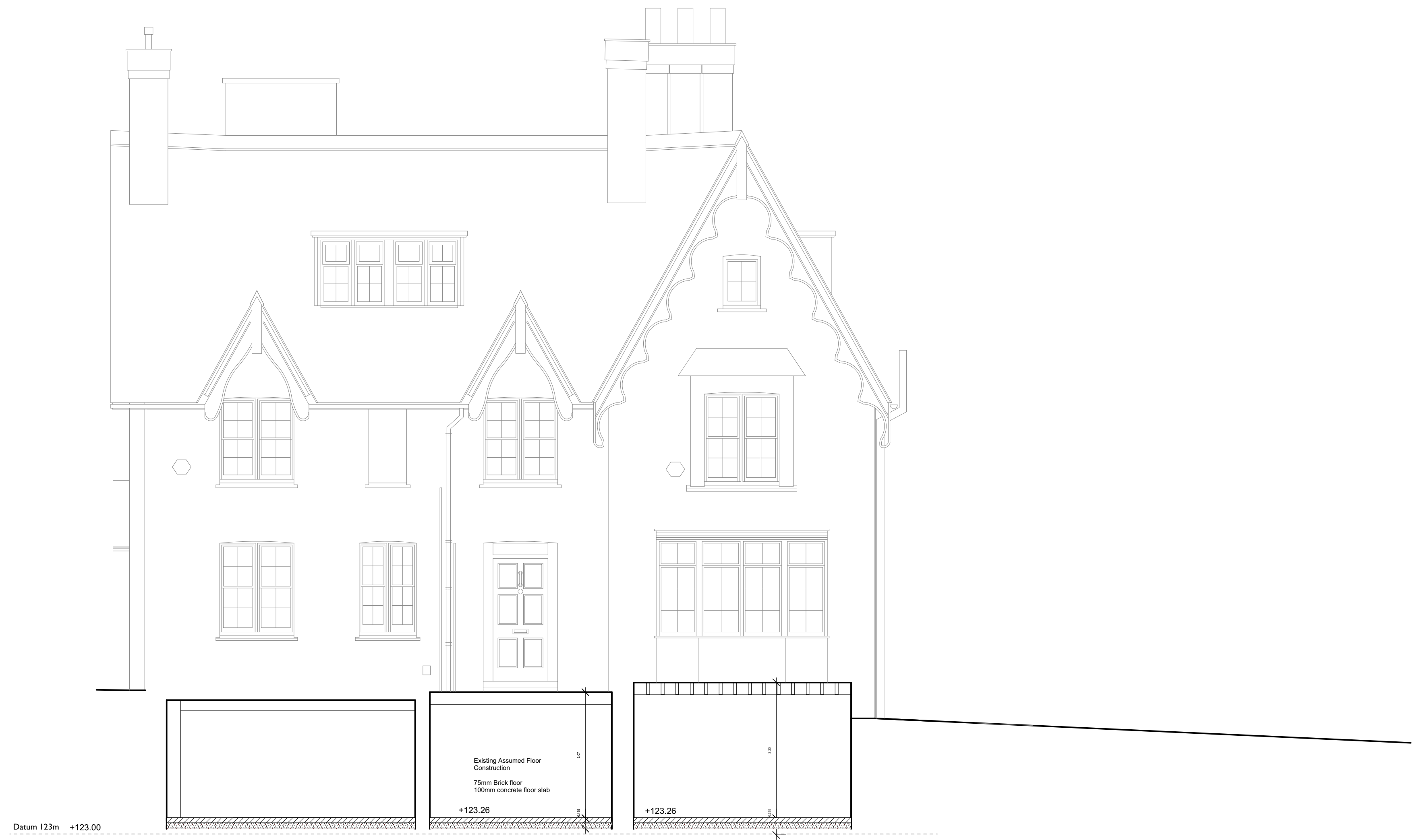
Existing Basement Section