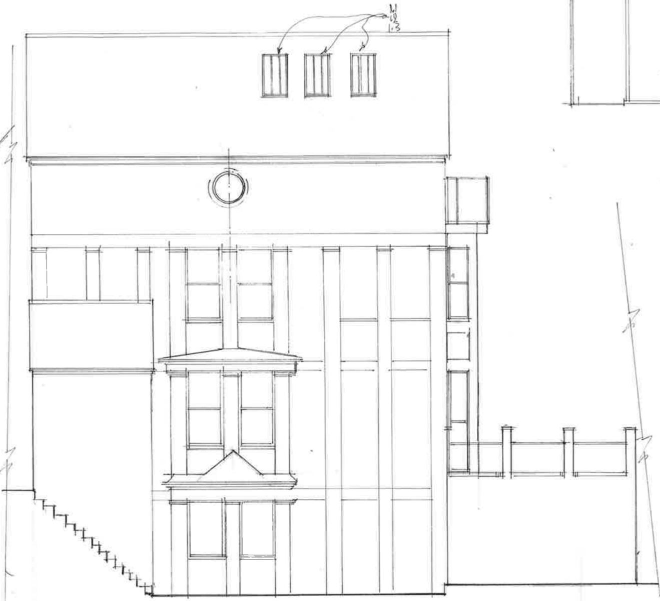
NORTH SIDE ELEVATION