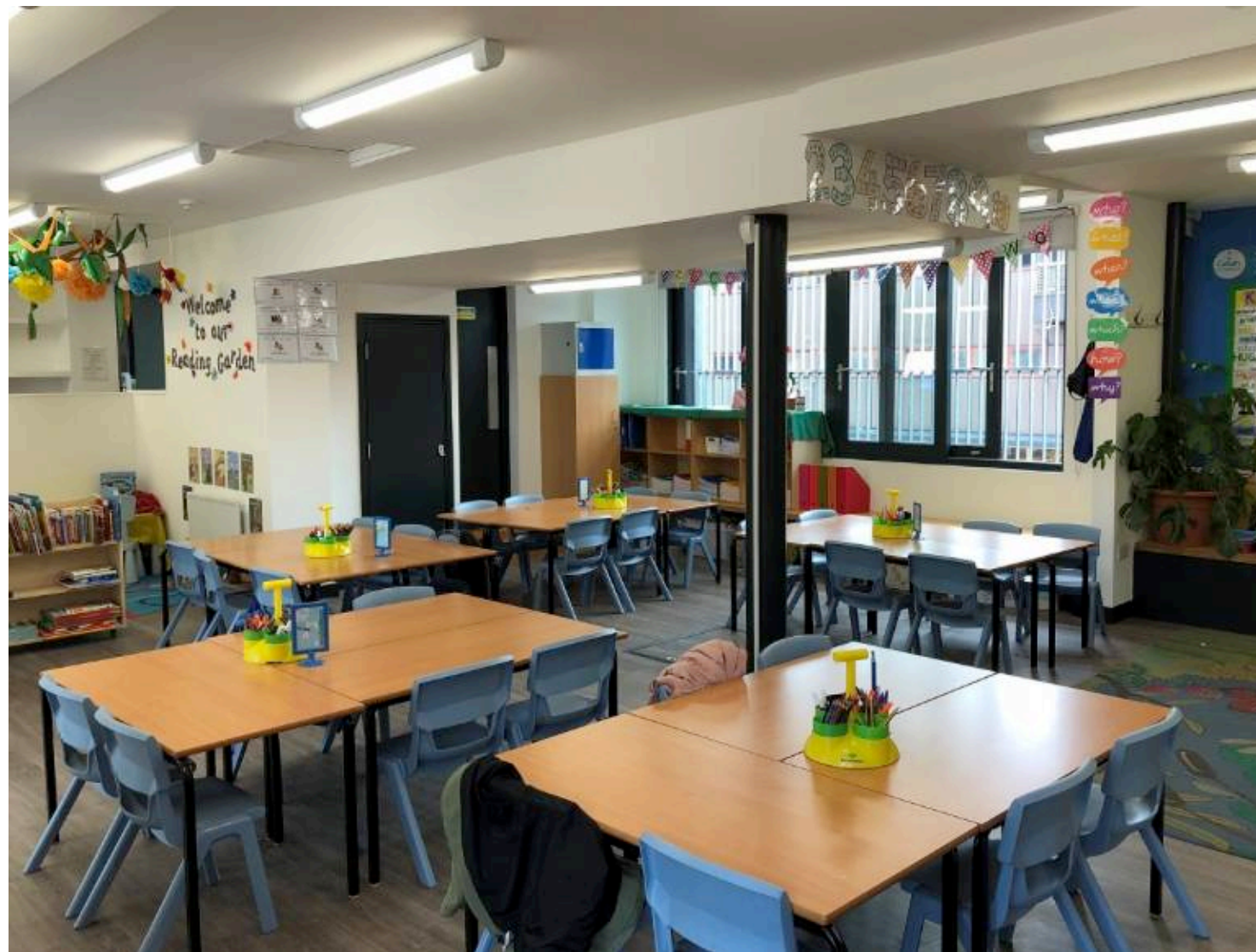
Year 2 Classroom at ground level