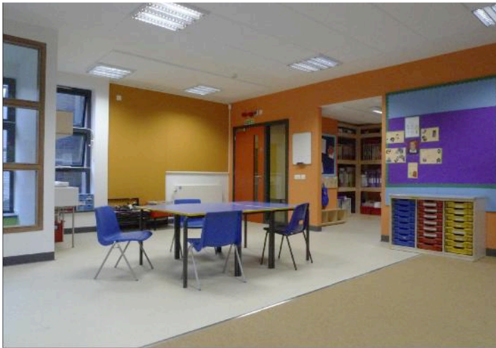
Year 4 classroom