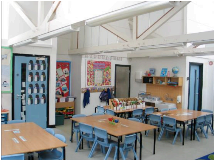
Year 1 classroom