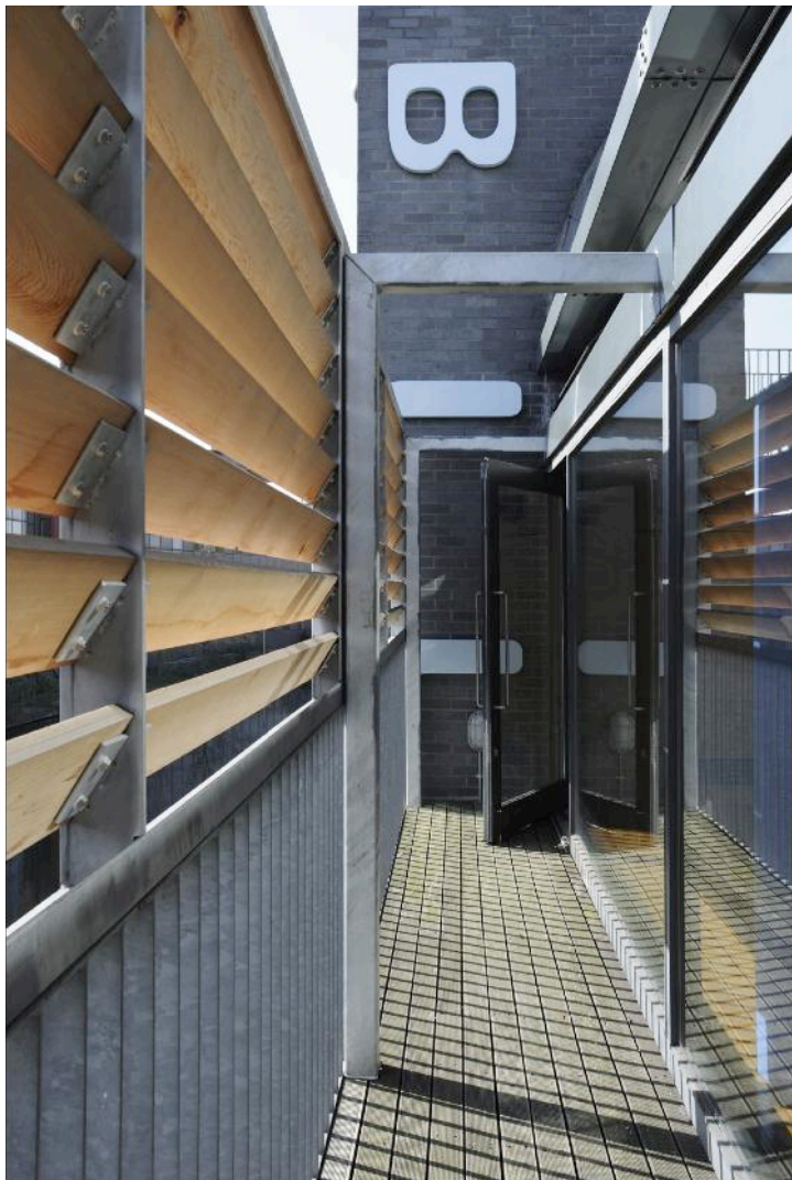
Solar shading to the main hall