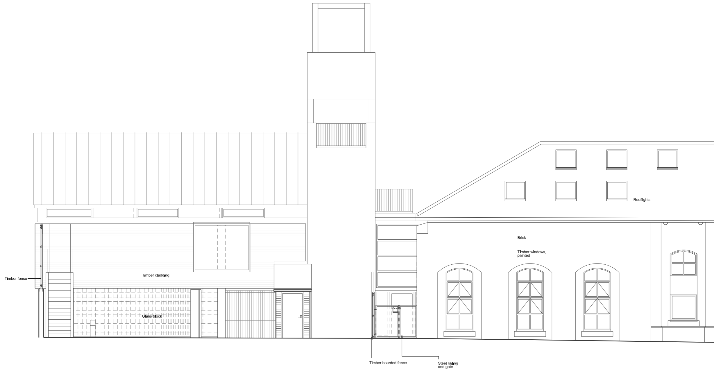
NORTH ELEVATION (PART)