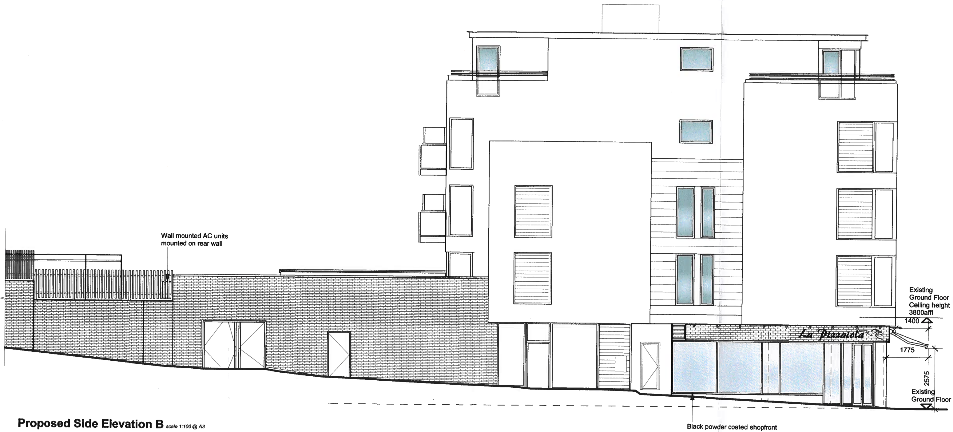
Proposed Side Elevation B scale 1:100 @ A3