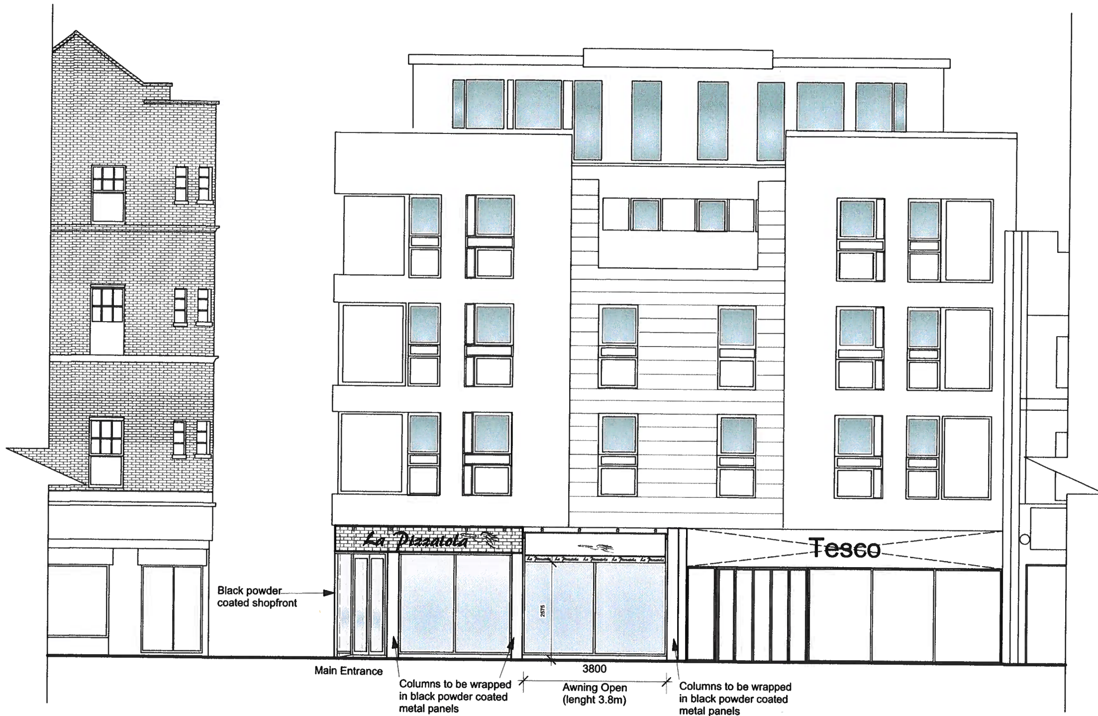
Proposed Front Elevation A scale 1:100 @ A3