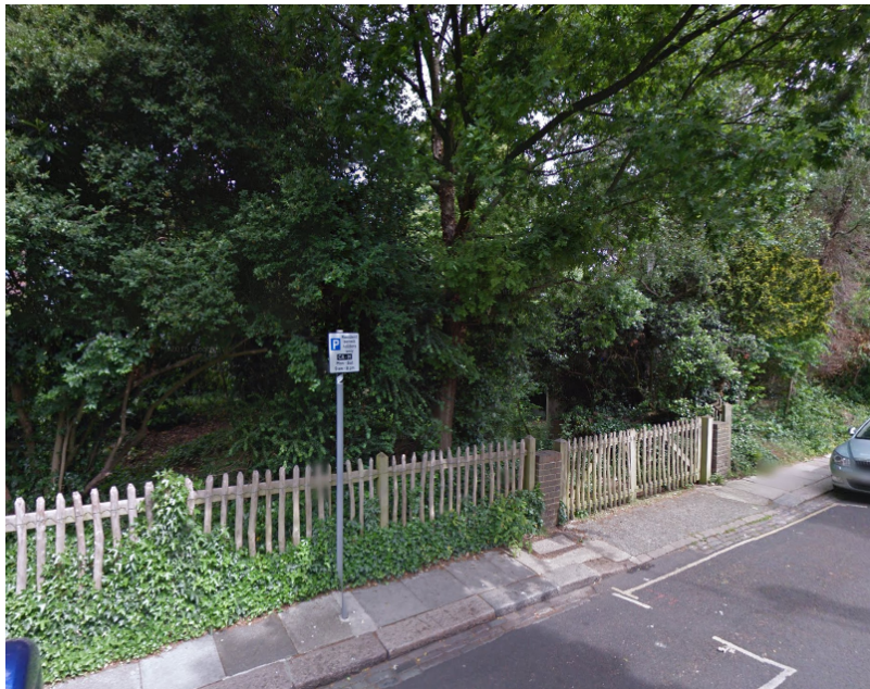
LOCATION A WITHOUT POLE