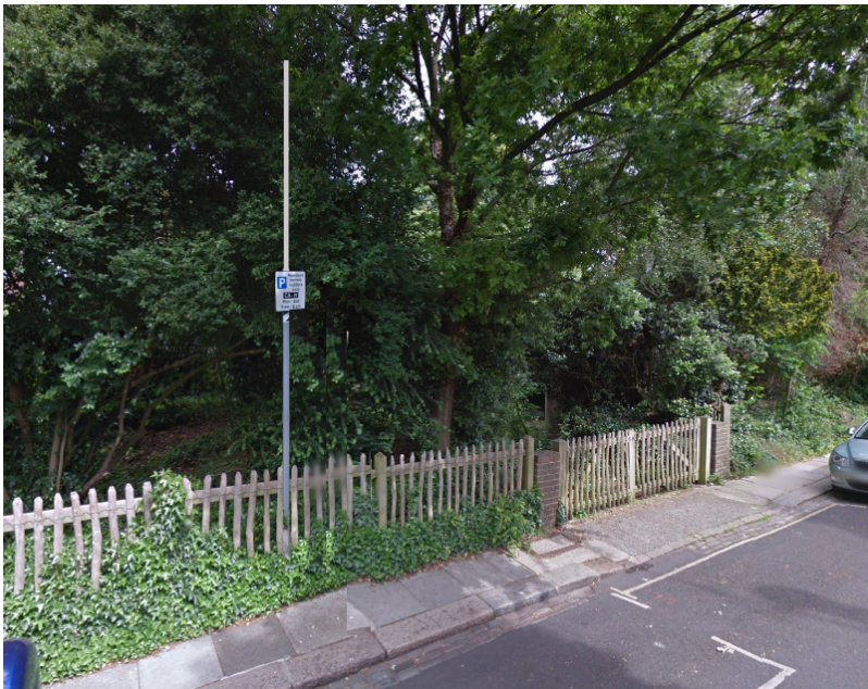
LOCATION A WITH POLE

The existing parking pole within the footpath to be replaced with a 5.5-metre high, 76dia pole in the same location but at the rear of the footpath adjacent to the cleft chestnut paling fence approx 3 metres to the left (southwest) of the brick pier with a clear nylon filament extending along and across Hampstead Grove to a replacement matching pole in the position of the 2.2 - metre high pole adjacent to the paling fence to the left (north) of the bank of recycling bins. Parking sign refixed at existing level and footpaths reinstated.