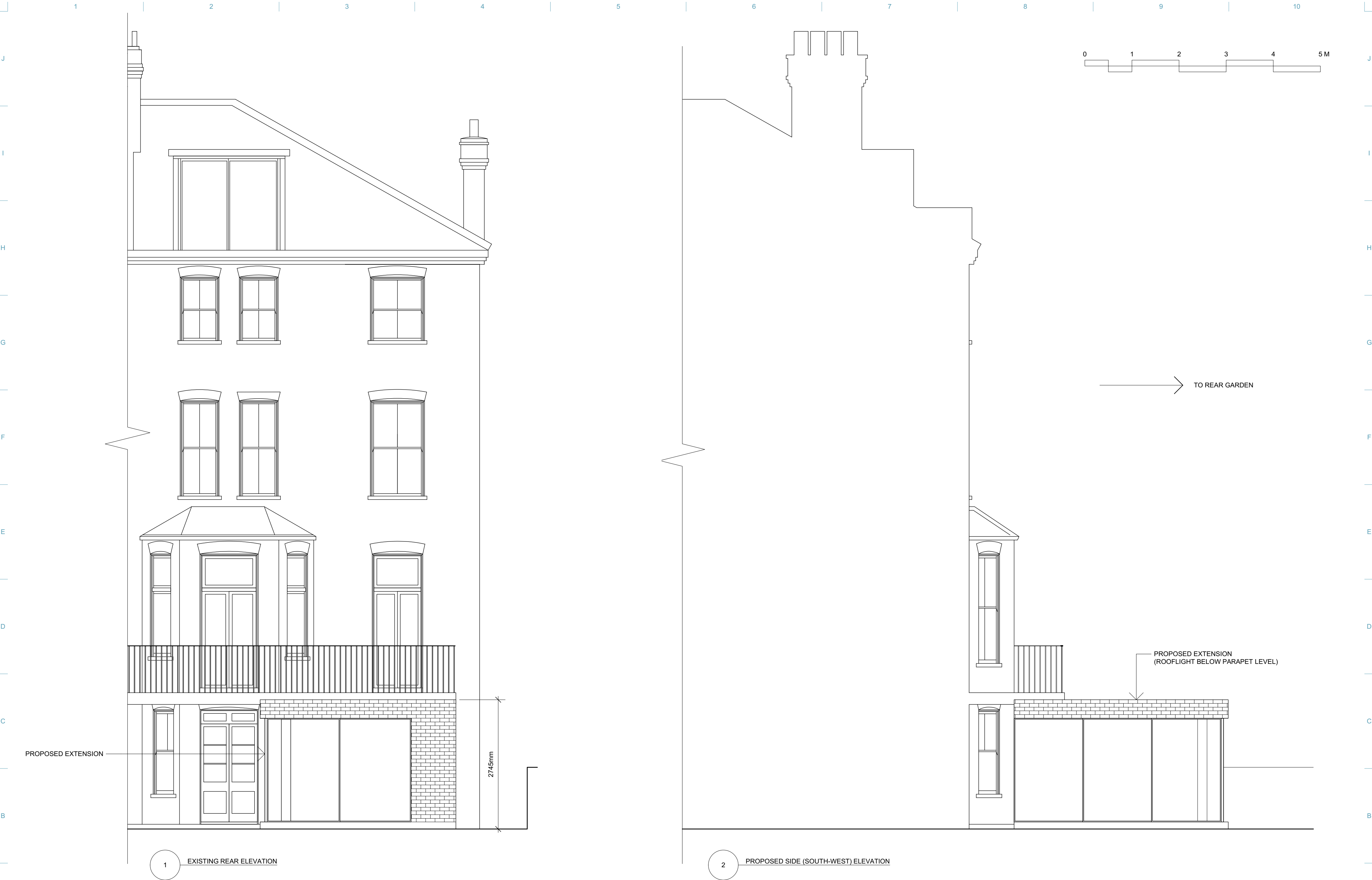
1 EXISTING REAR ELEVATION