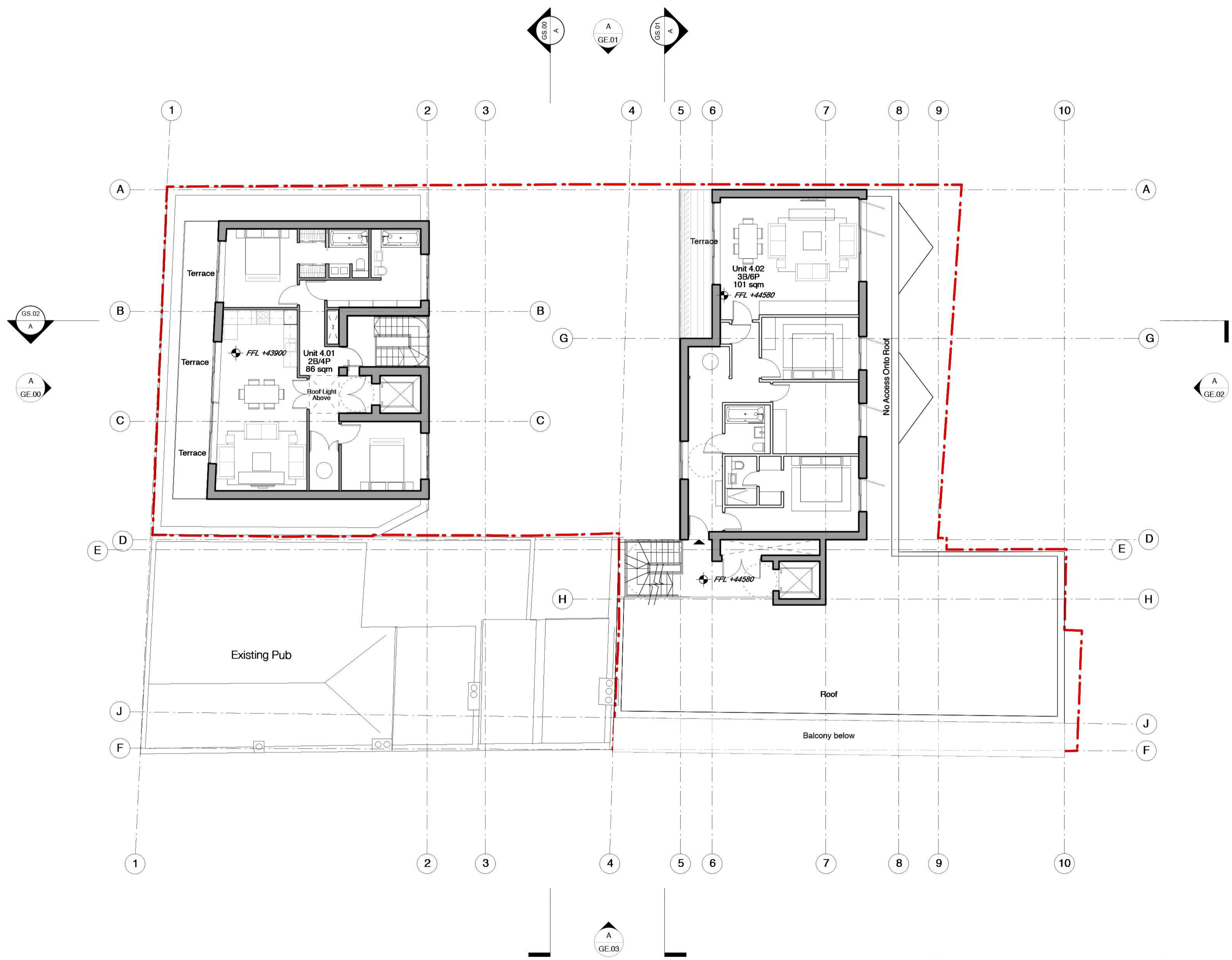
Fourth Floor Plan GA.04 1:200@A3_1:100@A1

Consented Drawing Planning reference 2015/0487/P dated 22nd December 2016