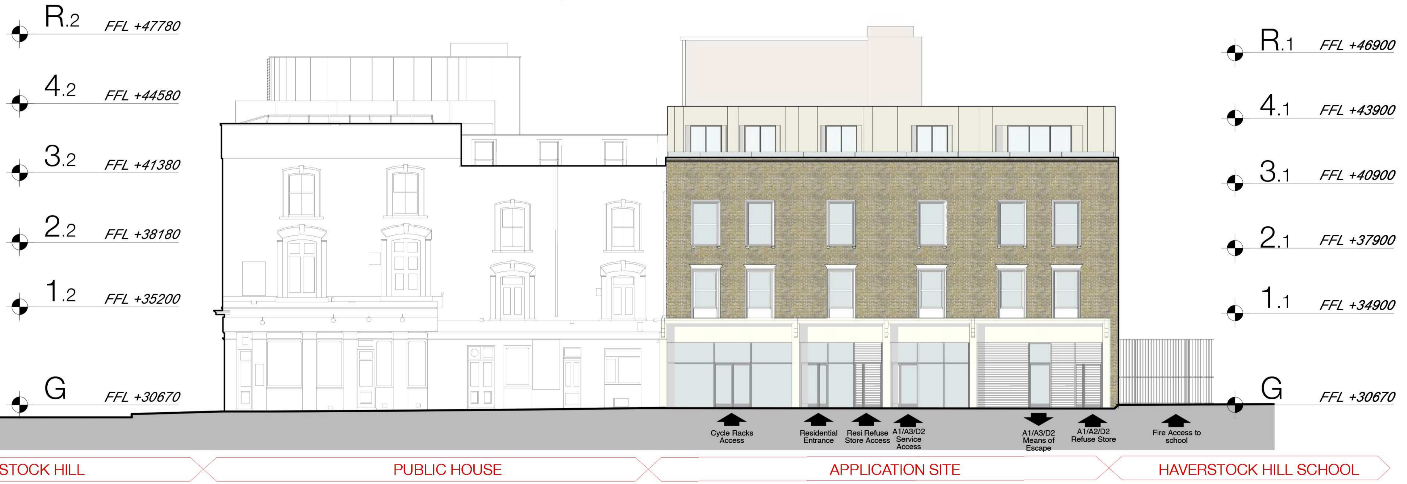
A Proposed South East Elevation GE.01 1:200@A3_1:100@A1