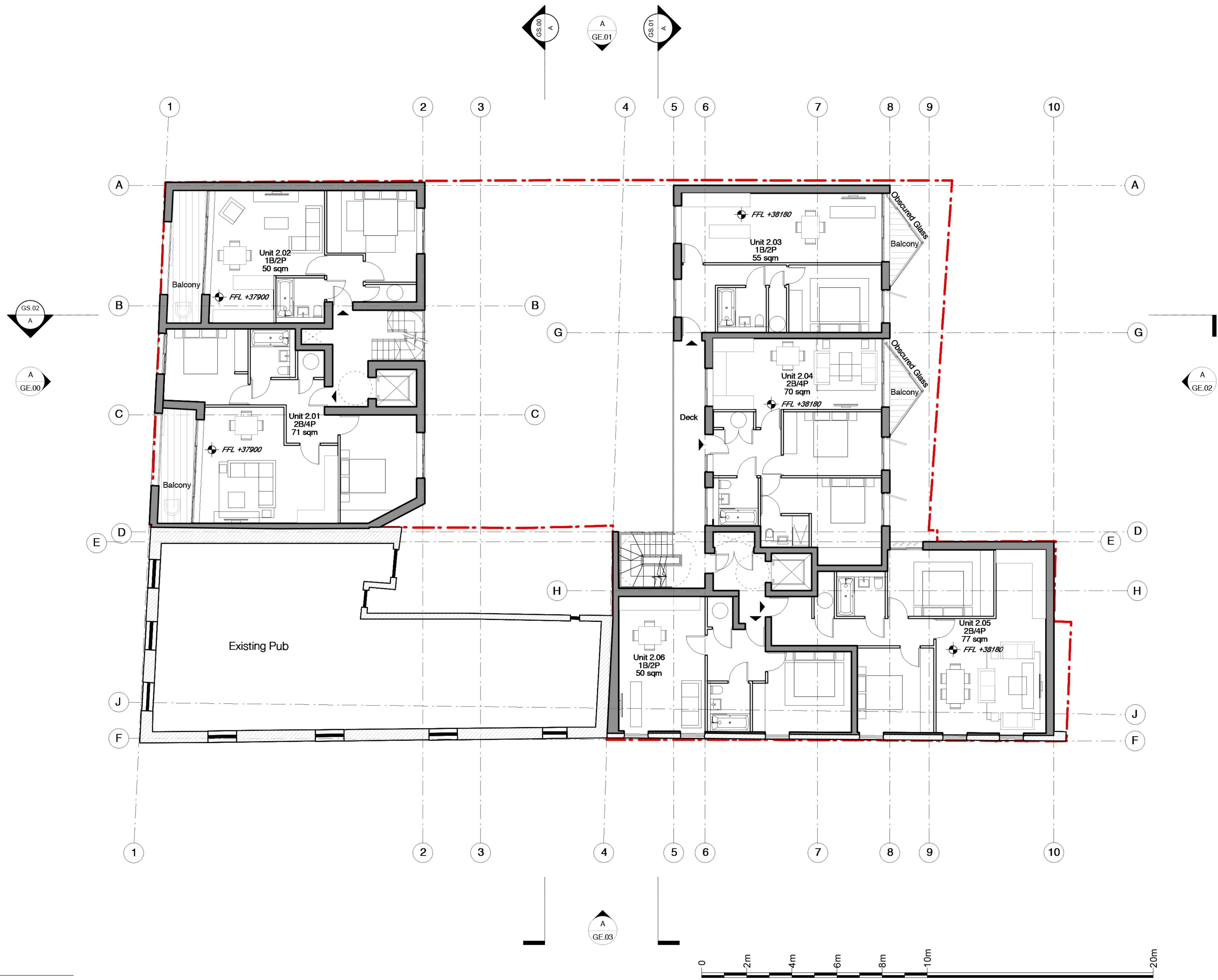
A GA.02 Second Floor Plan 1:200@A3_1:100@A1

Consented Drawing Planning reference 2015/0487/P dated 22nd December 2016