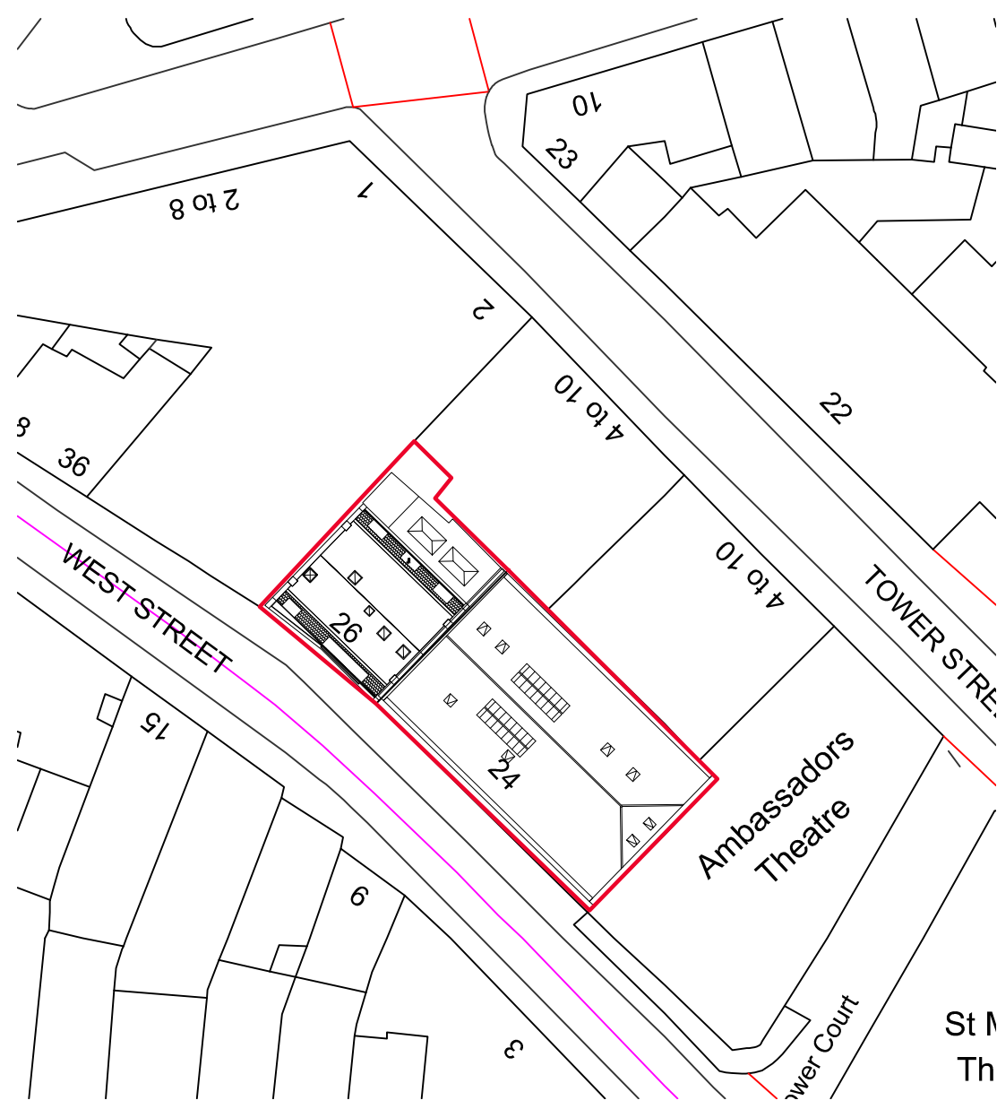
1 EXISTING BLOCK PLAN 1:500