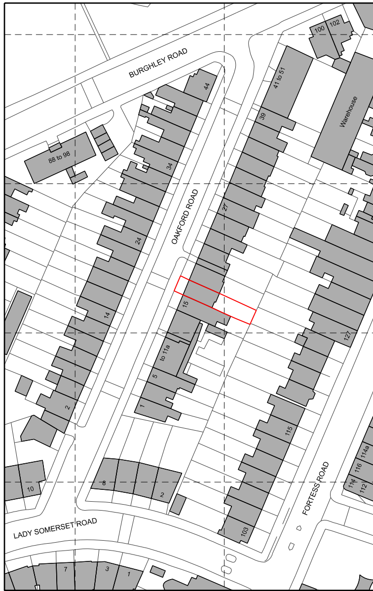
Site Location Plan - Existing 1:1250@A3

Ordnance Survey, (c) Crown Copyright 2019. All rights reserved. Licence number 100022432