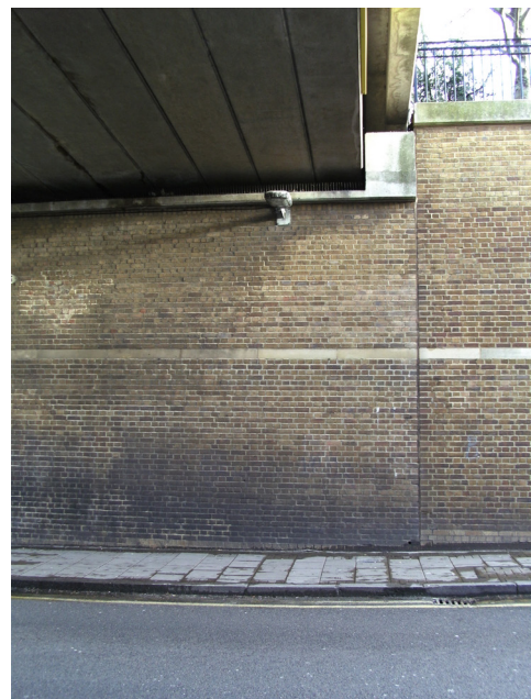
LOCATION B WITHOUT POST

A 1.05-metre high, 76dia post in the footpath, beneath the bridge overhang adjacent to the north end of the east and west bridge abutment walls on each side respectively of Juniper Crescent, leaving a 75mm clear gap between the wall and the rear of the post.