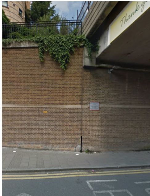
LOCATION A WITH POST

A 1.05-metre high, 76dia post in the footpath, beneath the bridge overhang adjacent to the north end of the east and west bridge abutment walls on each side respectively of Juniper Crescent, leaving a 75mm clear gap between the wall and the rear of the post.