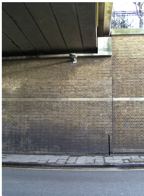
LOCATION B WITH POST