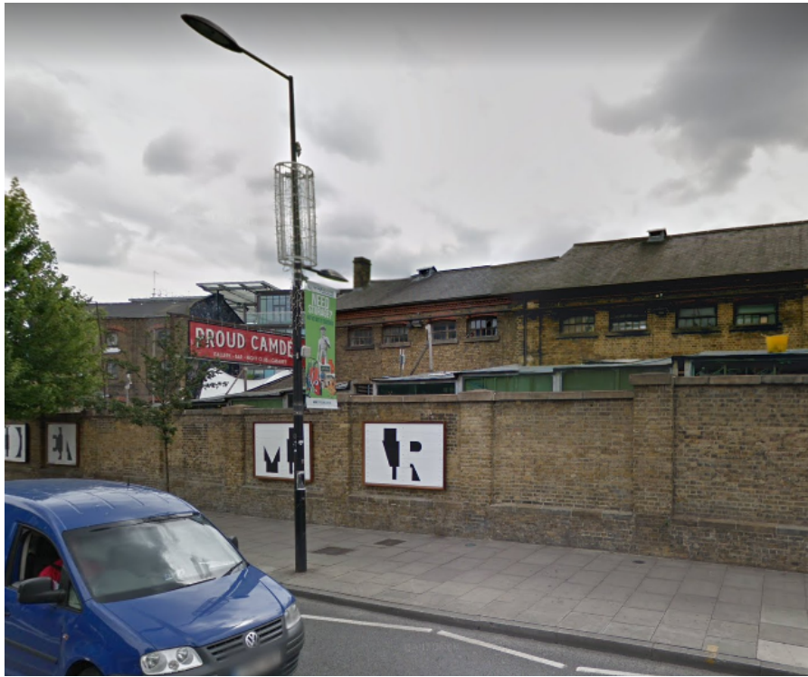
LOCATION C WITH POLE

A 5.5-metre high 76dia pole at the rear of the footpath adjacent to the brick pier to the left of the vehicular access to the rear of The Lock Tavern public house with clear nylon filament extending continue across Harmood Street to a matching pole at the rear of the footpath just beyond the rear wall of 56 Chalk Farm Road and extending diagonally across Chalk Farm Road to the top of an existing pole fixed to the top of the wall of The Stables.