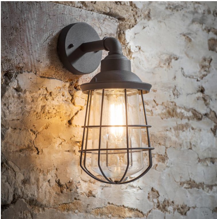
2 Proposed Fitting