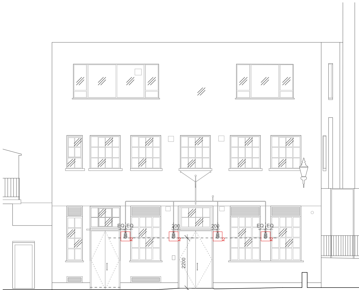
1 North Elevation - Symes Mews 1:100