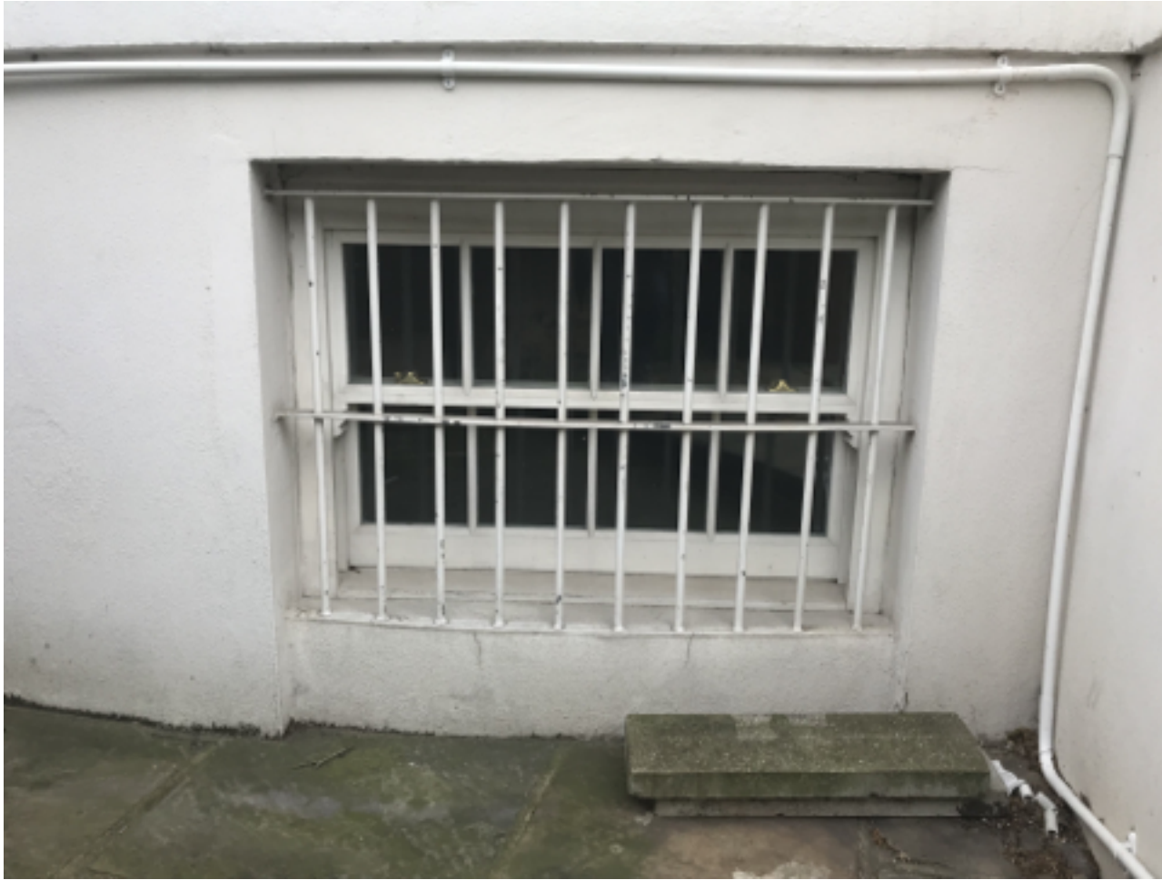
PHOTO - EXISTING WINDOW