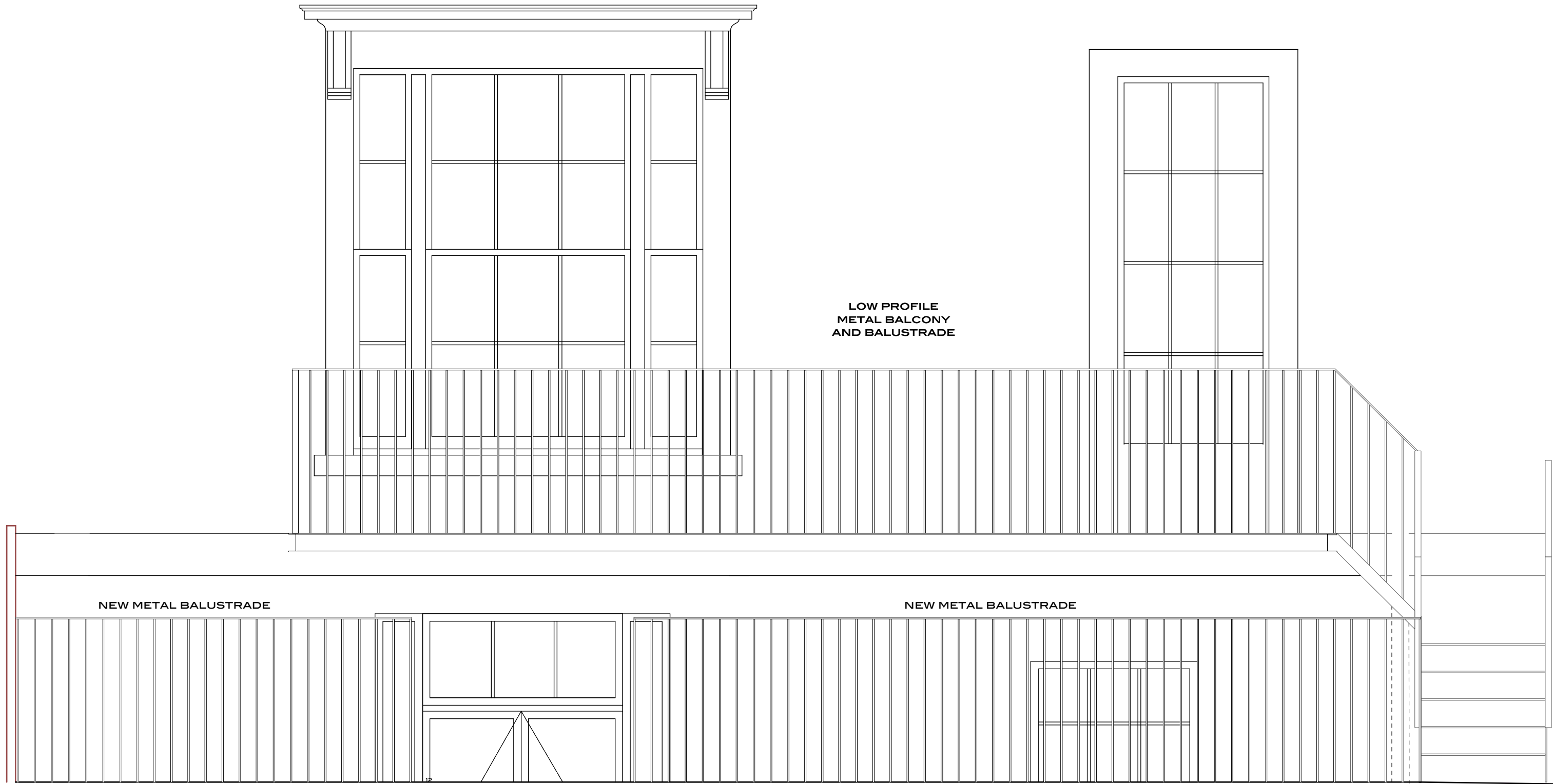
GARDEN RAILINGS - ELEVATION