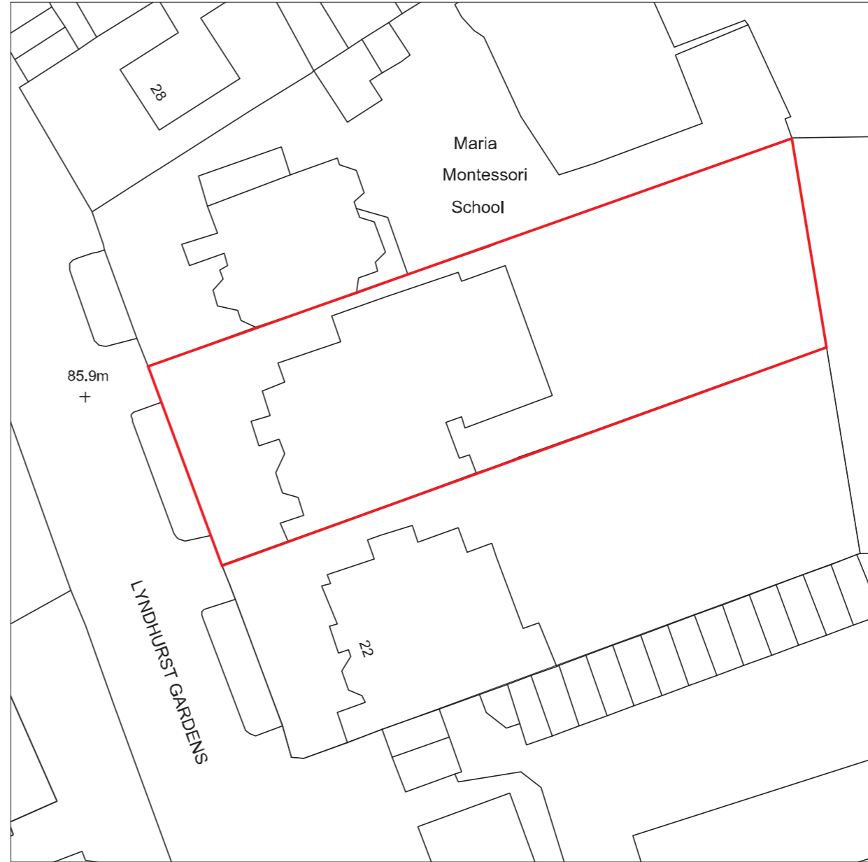
Location Plan. Scale 1:500