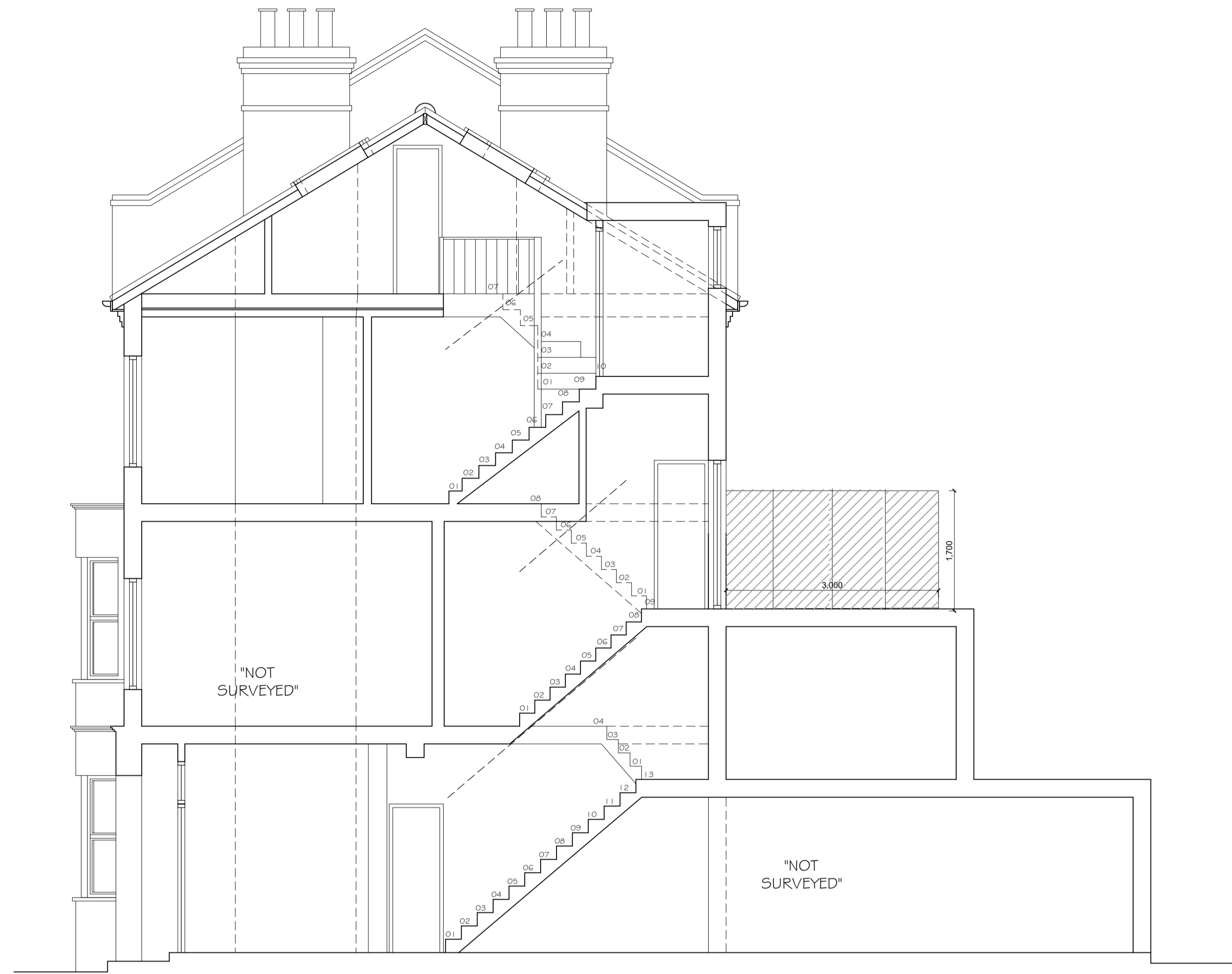
PROPOSED SECTION A-A