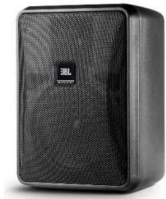
Figure 2-2: The proposed speaker, the JBL Control 25-1

The speakers will be JBL's Control 25-1, which are compact full-range speakers measuring 243mm tall, 188mm wide and 145mm deep. Whilst they are full-range speakers, the sound power emitted at the lower frequencies is naturally of a reduced level owing to the compact nature. From the datasheet (within Appendix A), the low-frequency roll off starts at around 100Hz with a sharp decline in noise level to a level of about -10 dB at 63 Hz. A picture of the speaker is shown in Figure 2-2.