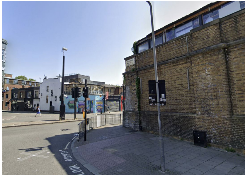
LAMP POST 1 AND PEDESTRIAN GUARD RAIL

A 5.5m high tapered pole at the rear of the footpath, located centrally beneath the high level floodlight fitting at the right hand end of the white painted flank façade of 48 Chalk Farm Road with a clear nylon filament crossing Chalk Farm Road to a lamp post situated in the footpath towards the end of Juniper Crescent (LP1) and crossing Juniper Crescent diagonally to a lamp post (LP2) and crossing the access road (to the former filling station) to a lamp post adjacent to the retaining wall (LP3). Pedestrian guardrail to have 200W x 855H 6mm clear polycarbonate panels fixed to each other on each side by means of cable ties, immediately below the filament.