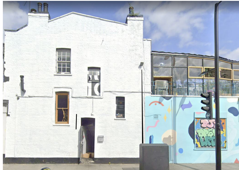
FLANK OF 48 CHALK FARM ROAD WITH POLE