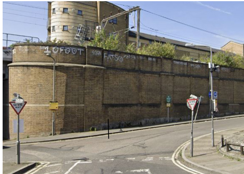
LAMP POSTS 2 AND 3