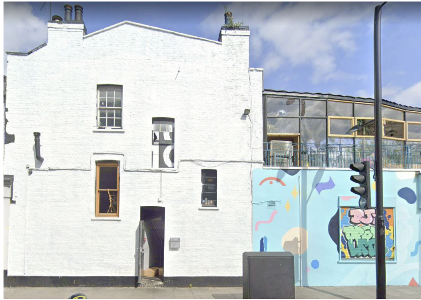
FLANK OF 48 CHALK FARM ROAD WITHOUT POLE