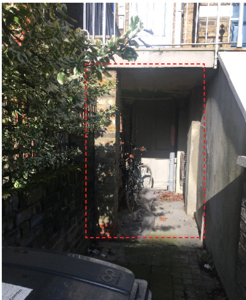
Front Elevation - Storage area next to the main entrance