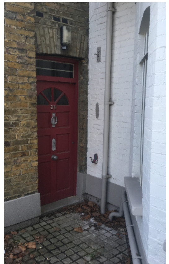
Front Elevation - Secondary entrance of Flat 1