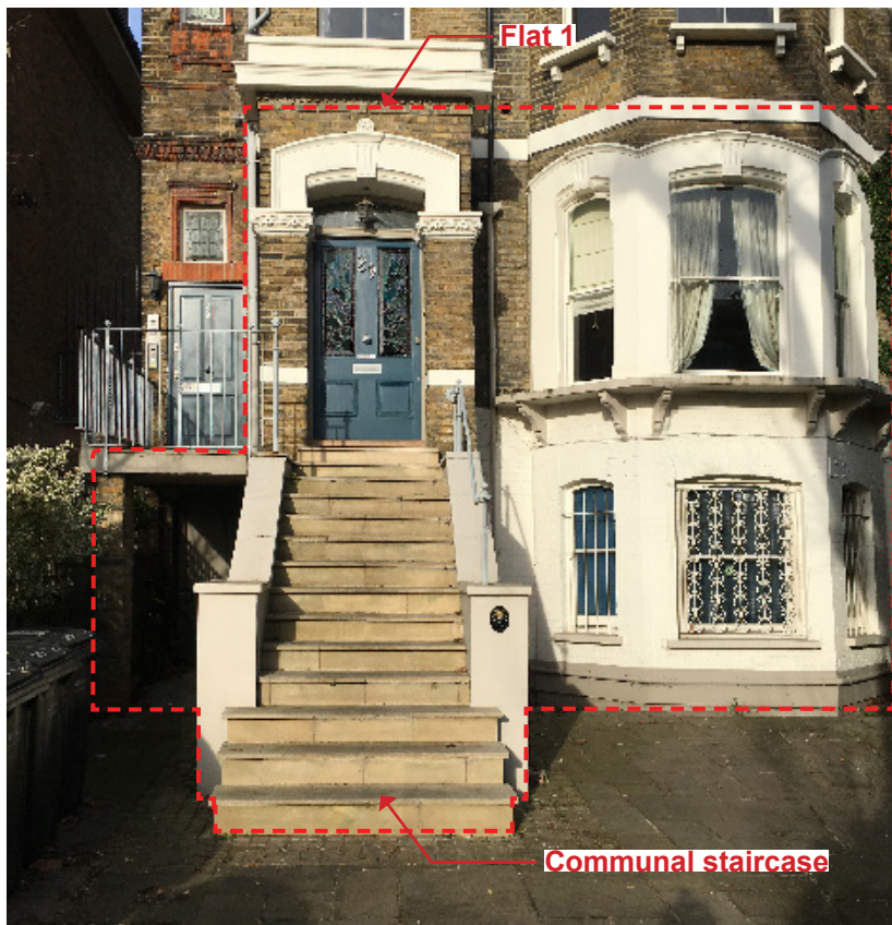
Front Elevation - Main entrance of Flat 1