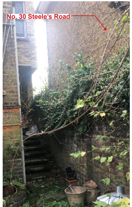
Staircase from rear garden to raised ground floor of Flat 1