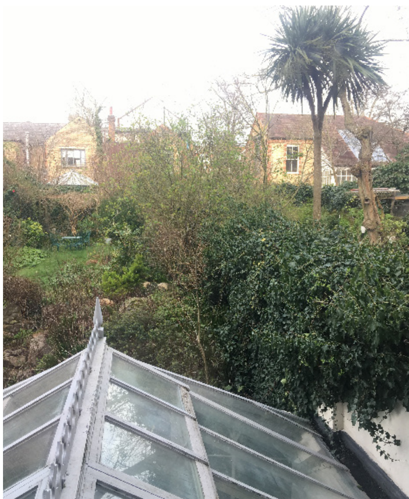
Real elevation - View of the garden from the upper ground floor living room