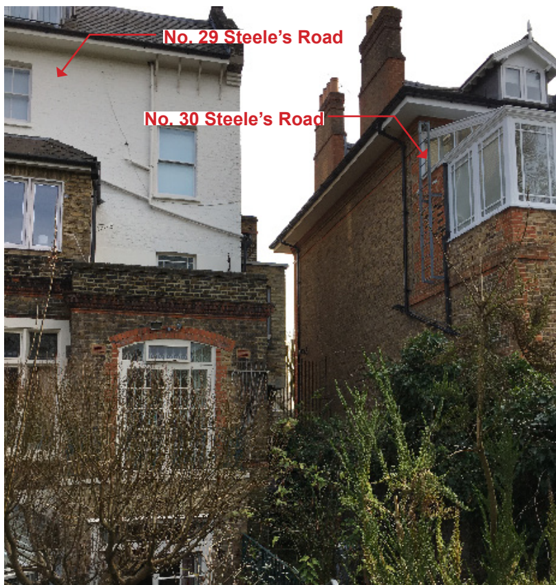
Boundaries with No. 30 Steele's Road