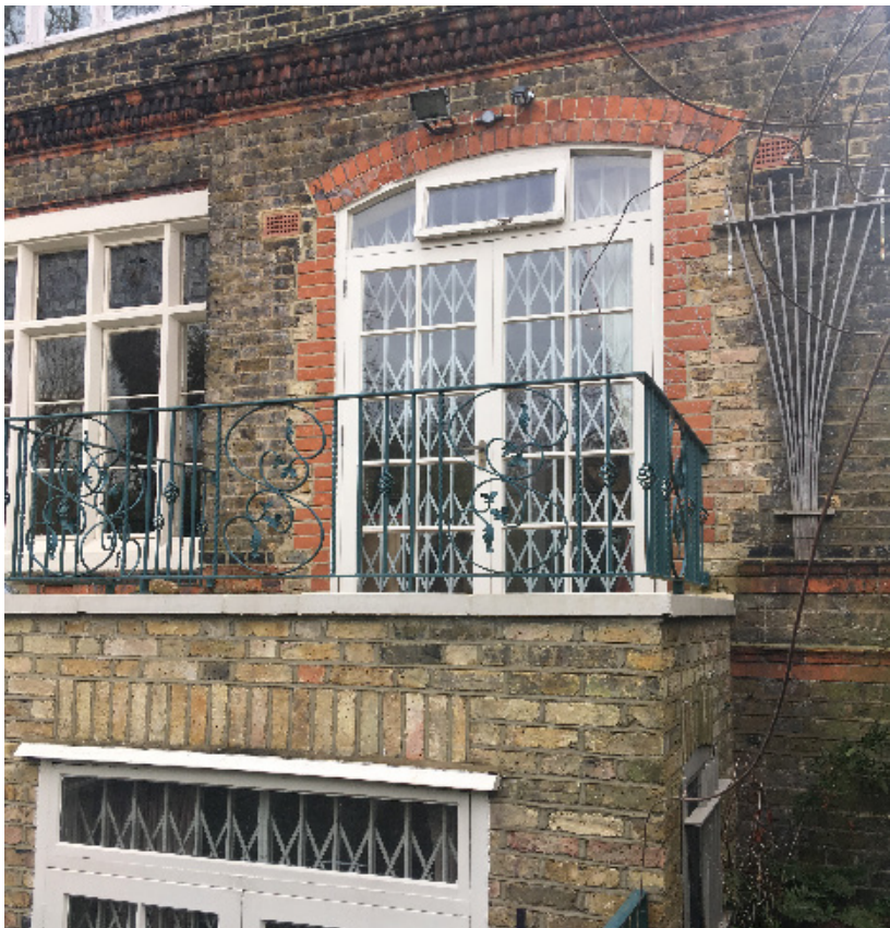
Rear elevation - Raised ground floor terrace of Flat 1