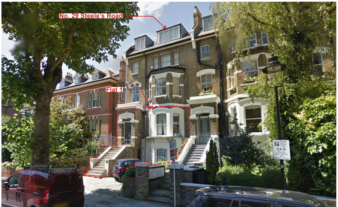
Front Elevation of No. 29 Steele's Road