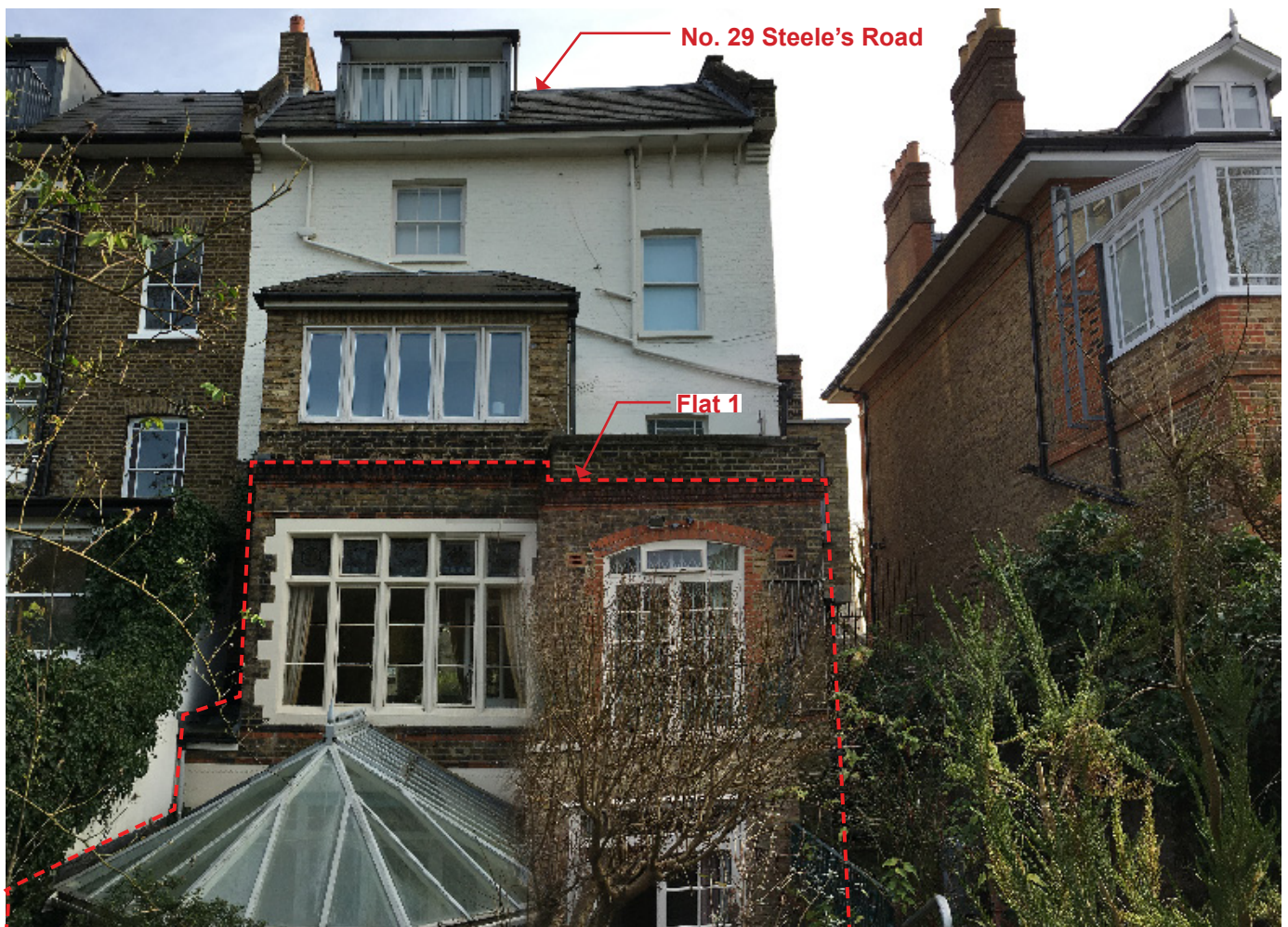
Rear Elevation of No. 29 Steele's Road