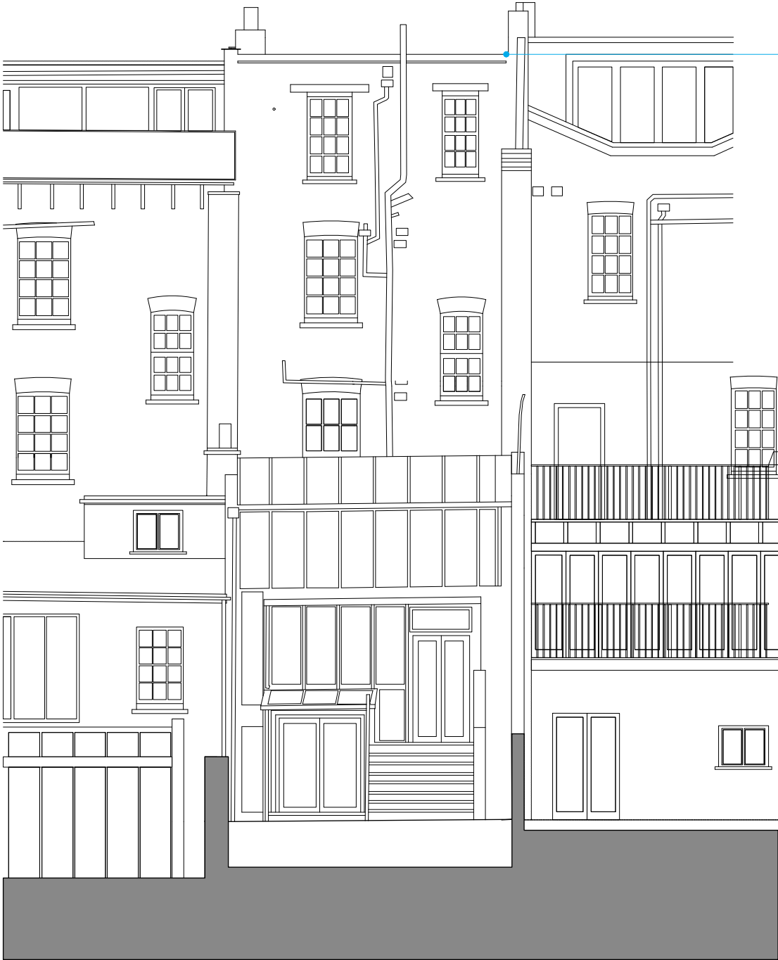
1 Existing Rear Elevation 1:100