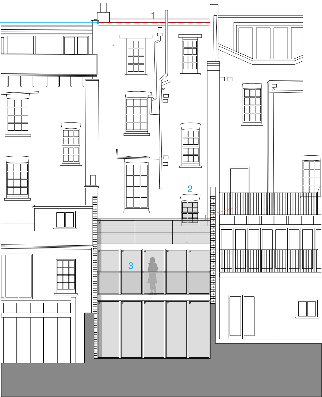
2 Proposed Rear Elevation 1:100