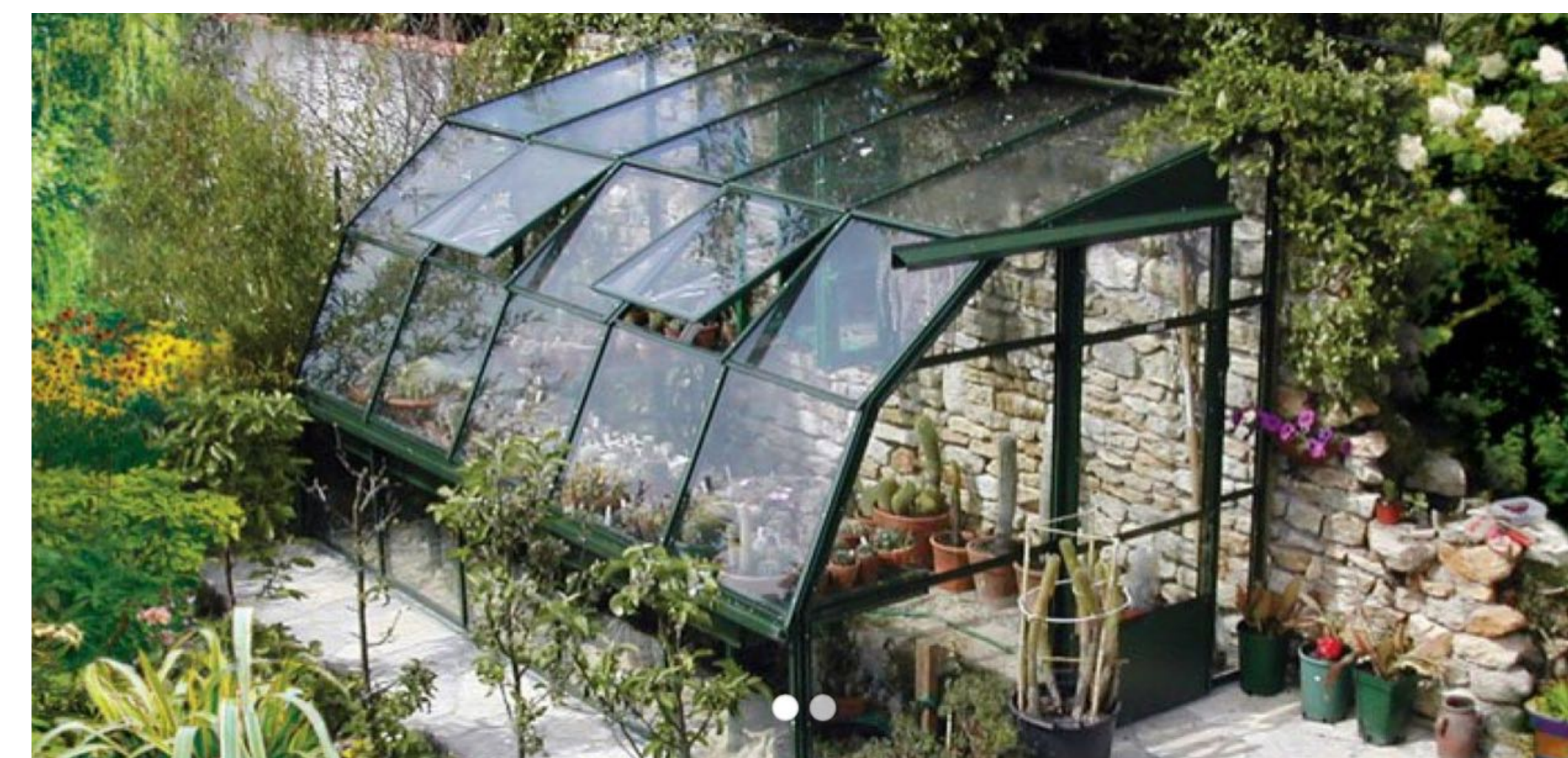
'LEAN-TO' GLASS HOUSE TO BE FIXED TO EXISTING WALL. PRODUCT: "THE HARTLEY LEAN-TO" - 5 PANELS BY HARTLEY BOTANIC DIMENSIONS: 2235x3776x2192MM H TO BE BUILT ON TOP OF SMALL BRICK WALL. TOTAL HEIGHT FROM FINISH FLOOR LEVEL: 2500MM H