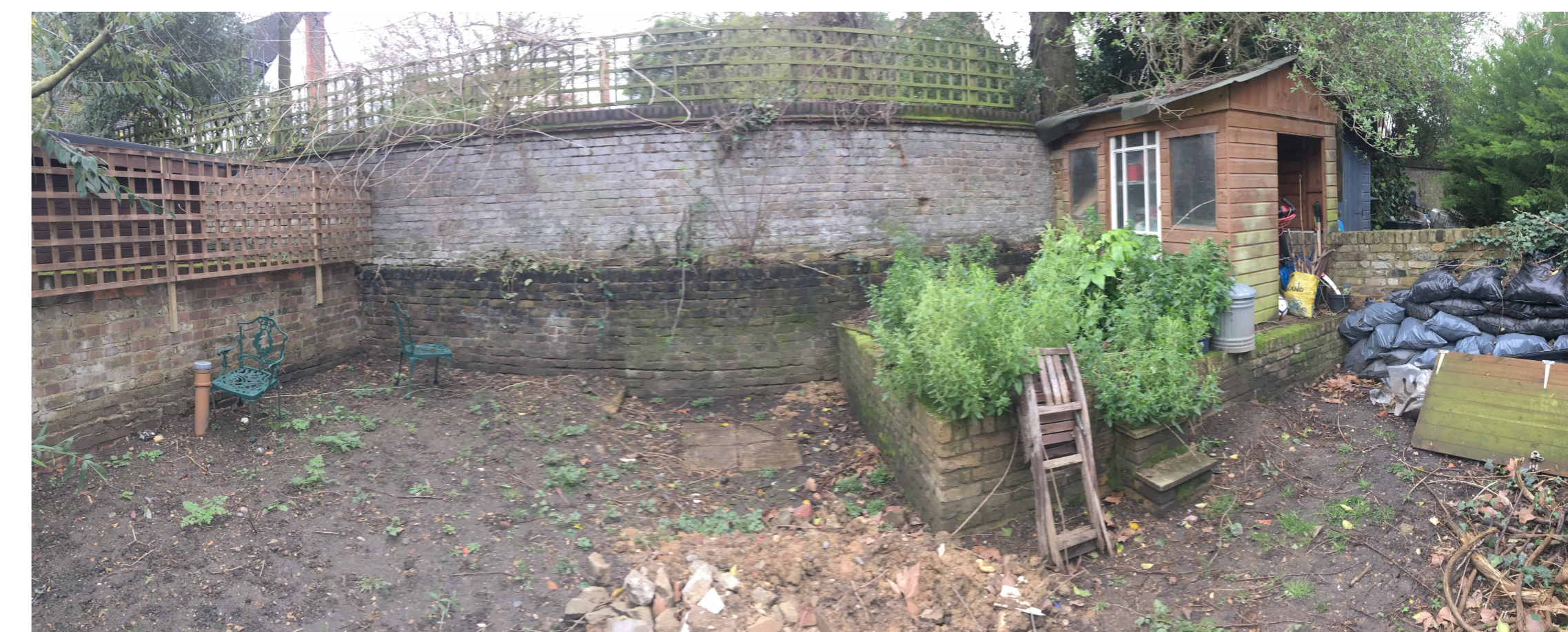
REAR GARDEN_CURRENT SITUATION