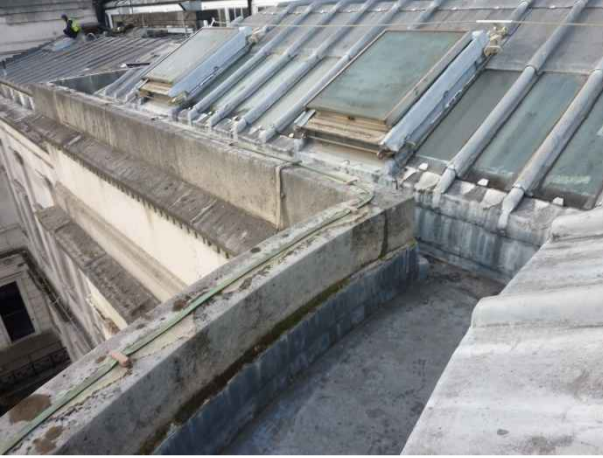
Roof 5 - RL 10