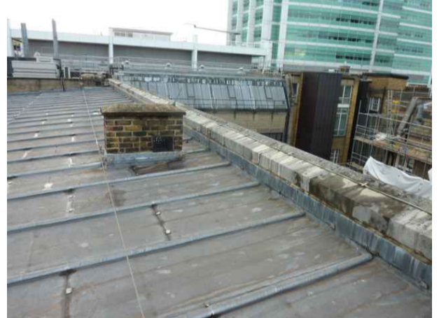
Roof 1 - CS 6