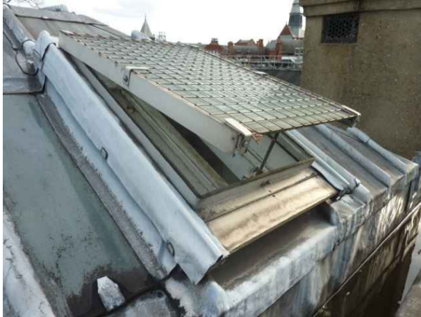
Roof 5 - RL 8