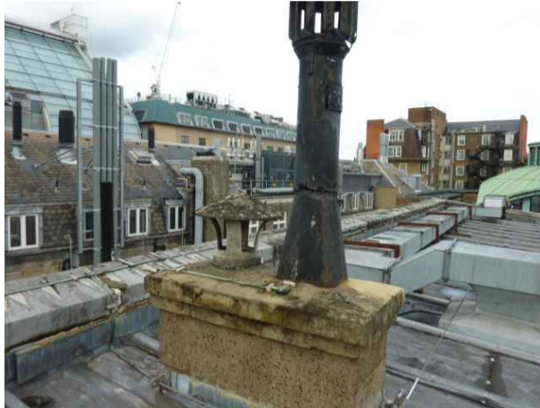
Roof 1 - CS 2