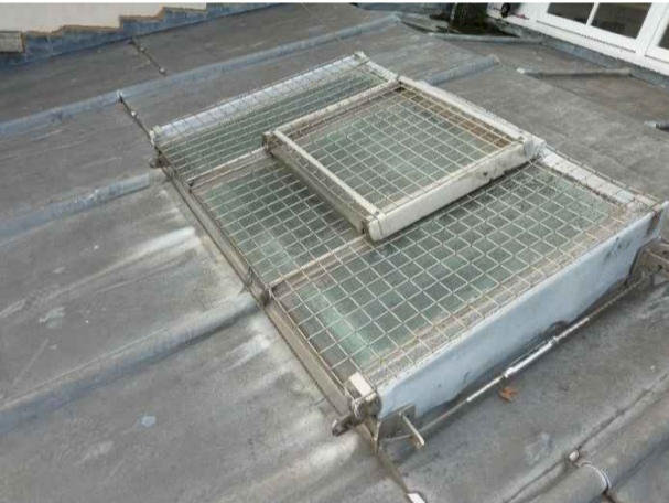
Roof 7 - RL 6