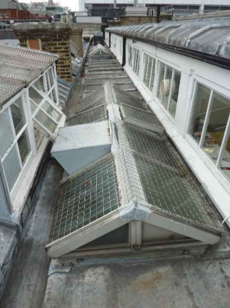
Roof 6 - RL 2