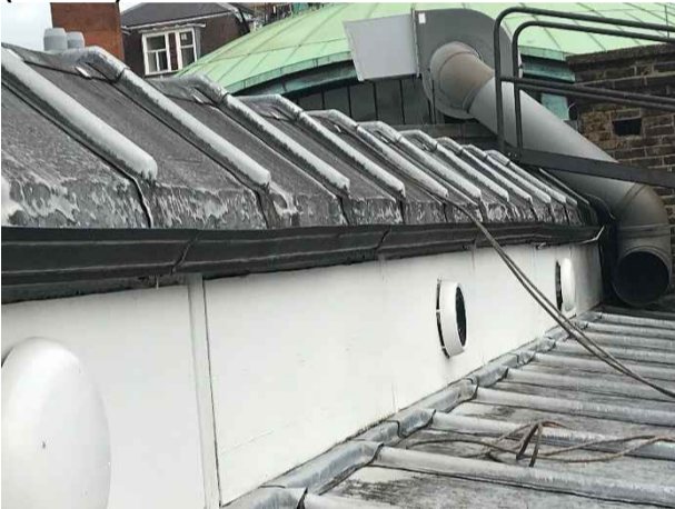
Front Elevation – Clerestory Mezzanine (Roof 4)