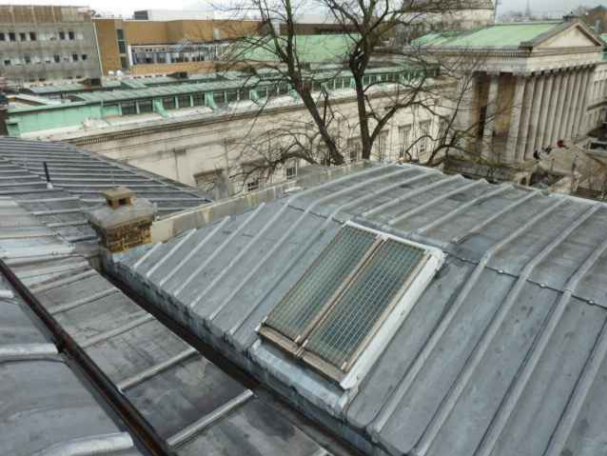
Roof 5 - RL 3