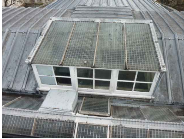
Roof 5 - RL 11