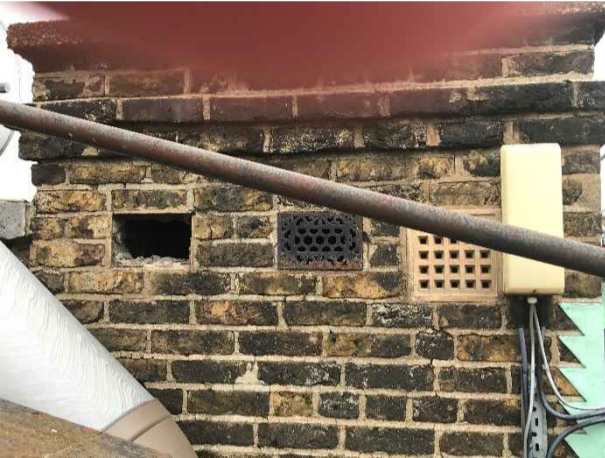
Roof 1 - CS 1