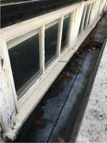
Front Elevation – Clerestory (Roof 7)