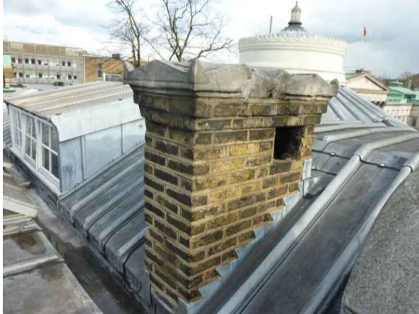
Roof 5 - CS 11