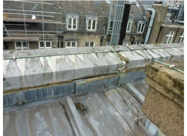
Roof 1 - CS 3