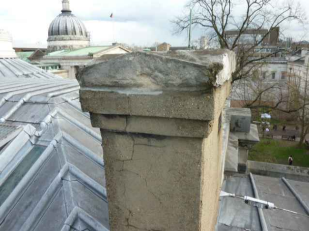
Roof 5 - CS 10