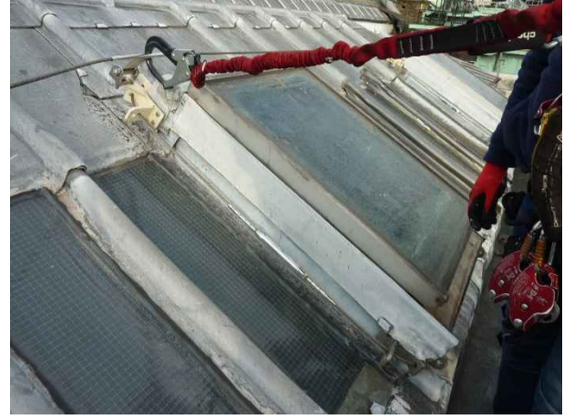
Roof 5 - RL 12