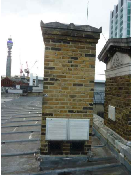
Roof 1 - CS 5