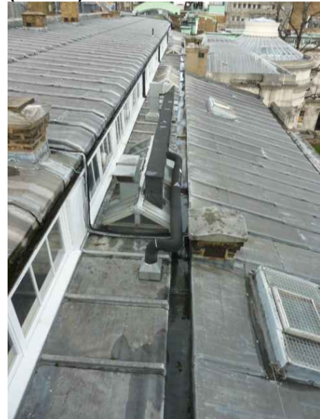
Front Elevation – Clerestory Mezzanine (Roof 6)