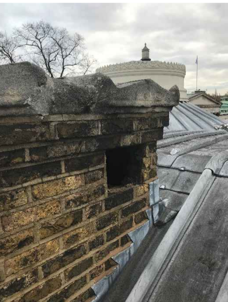
Roof 4 - CS 12