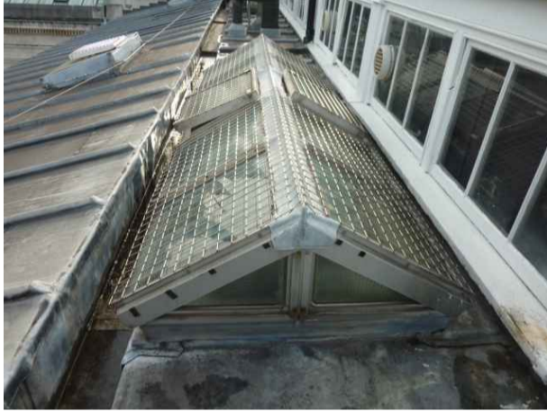
Roof 6 - RL 4