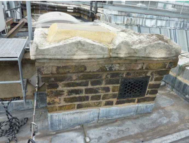
Roof 1 - CS 7