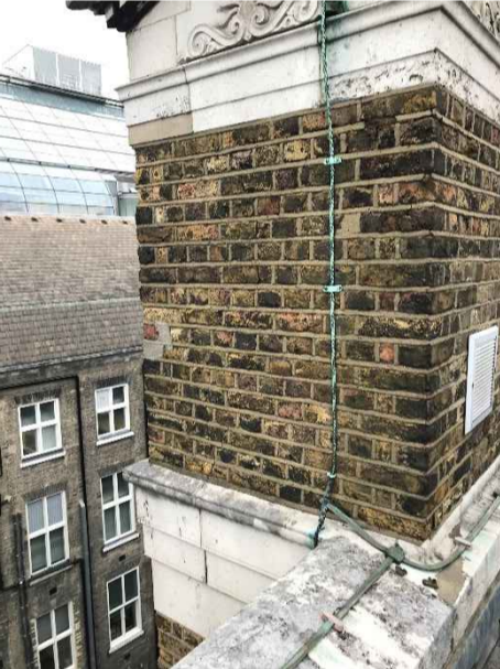
Roof 1 - CS 4