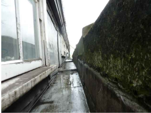
Front Elevation – Clerestory Roof 4)