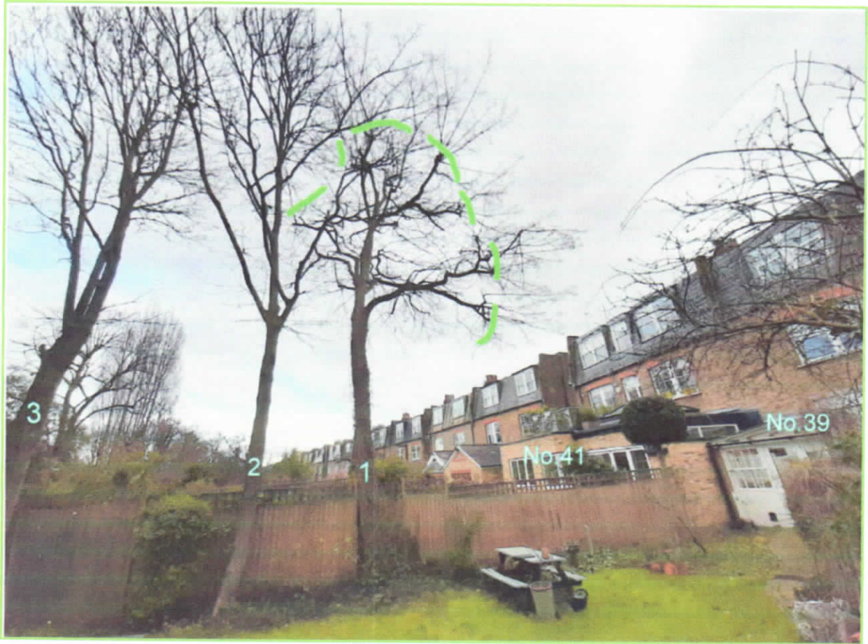
The green dashed line indicates the proposed pruning