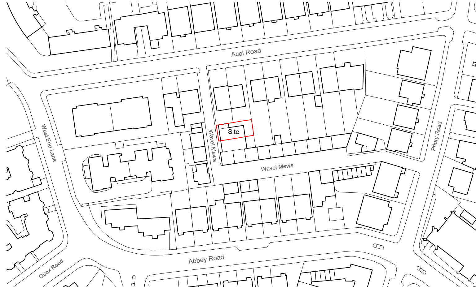
836/30 Site Location Plan 01 1:1250 @ A3