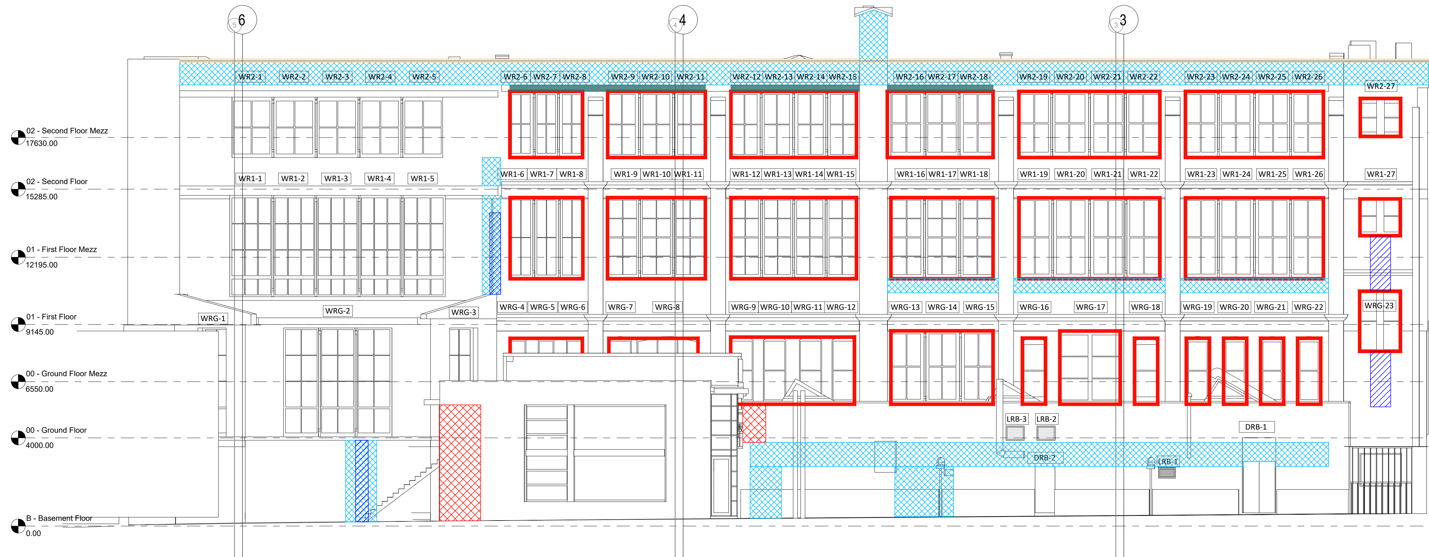
REAR ELEVATION Proposed Repair