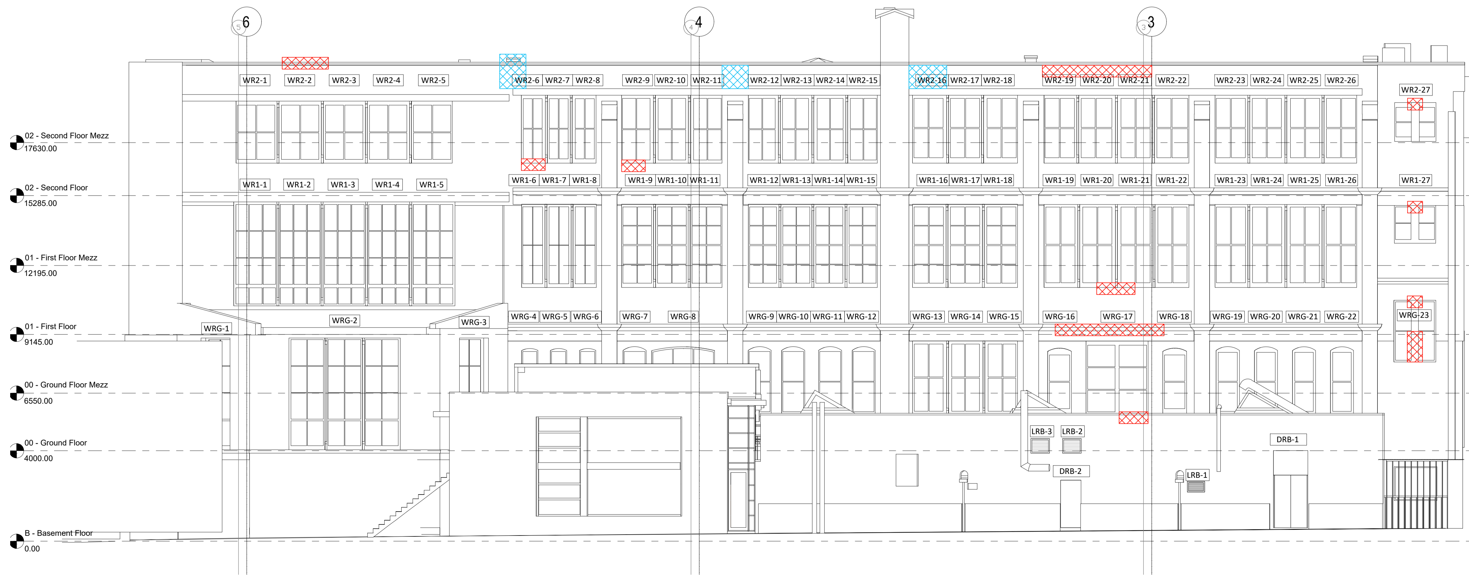
REAR ELEVATION Proposed Stonework Repairs