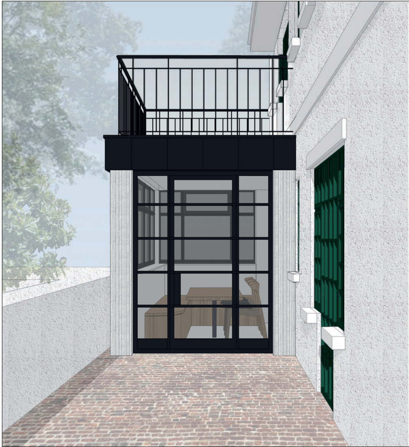
EXTERNAL VIEW OF PROPOSED SIDE EXTENSION