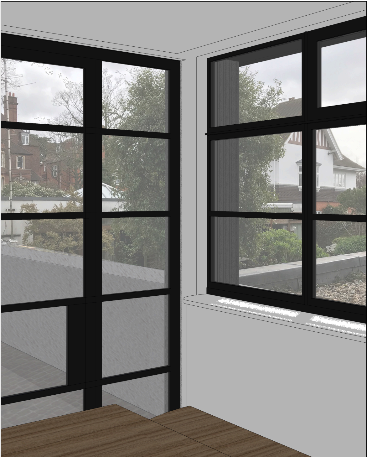
VIEW FROM DINING ROOM