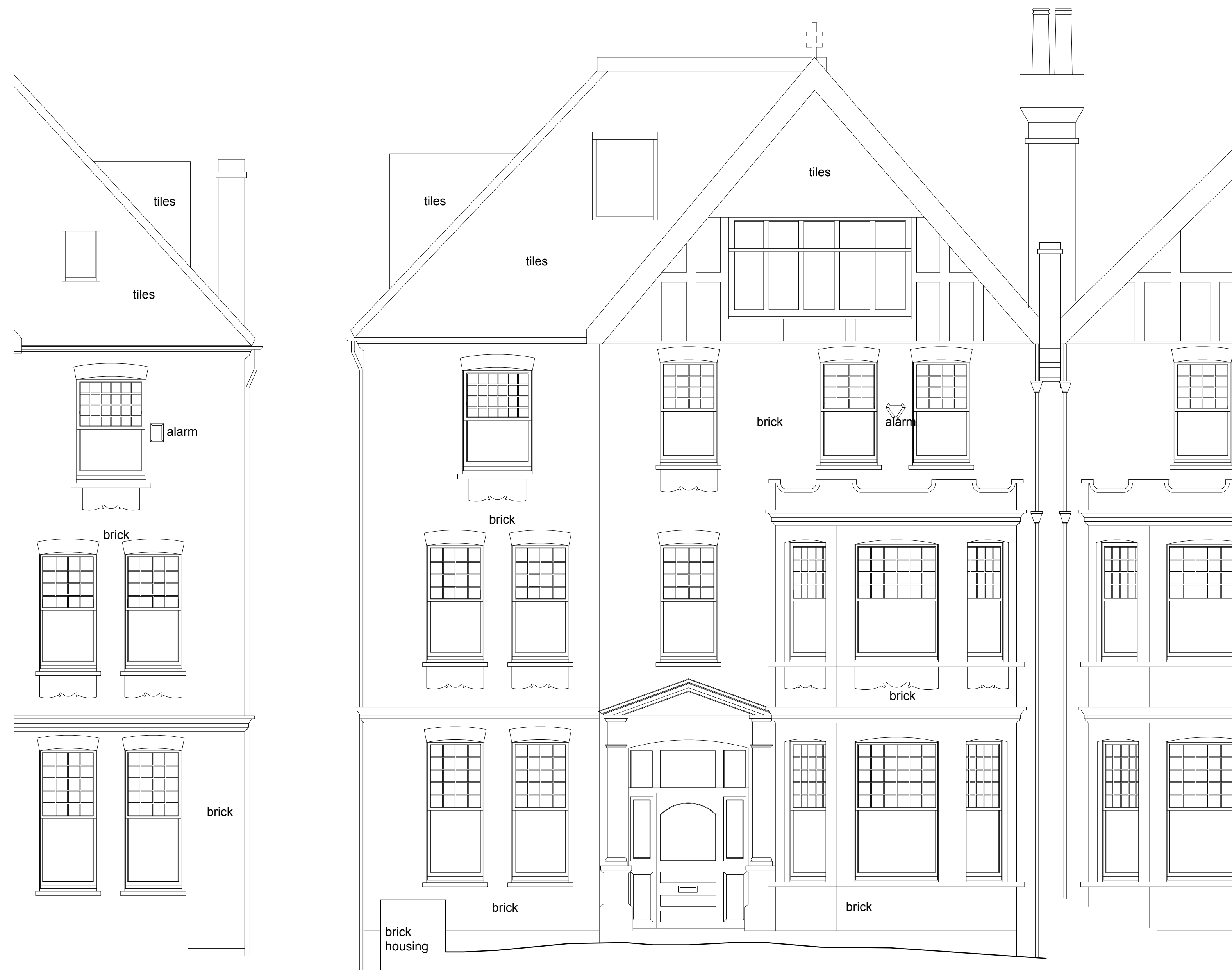
1 EXISTING FRONT ELEVATION