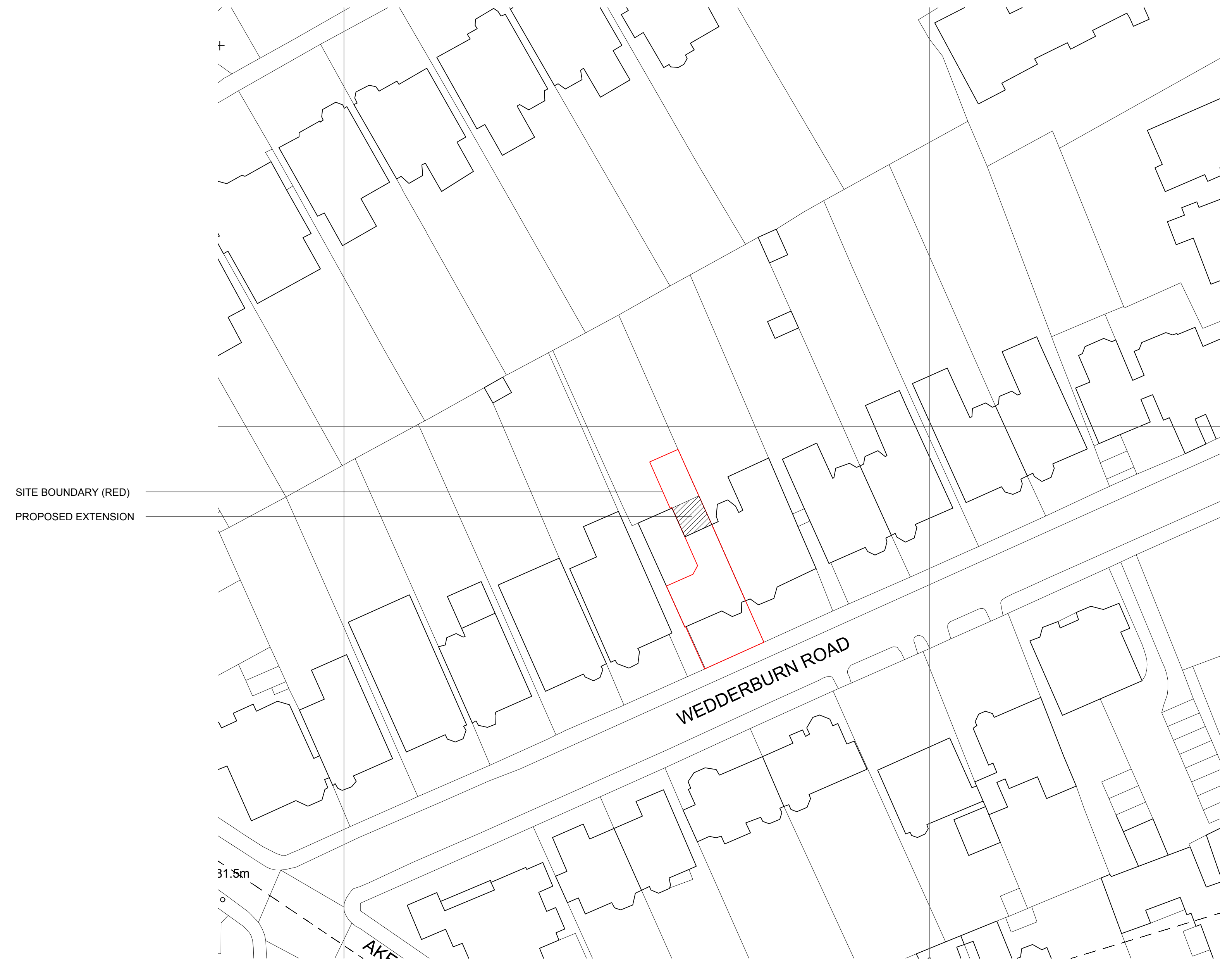
SITE BOUNDARY (RED) PROPOSED EXTENSION