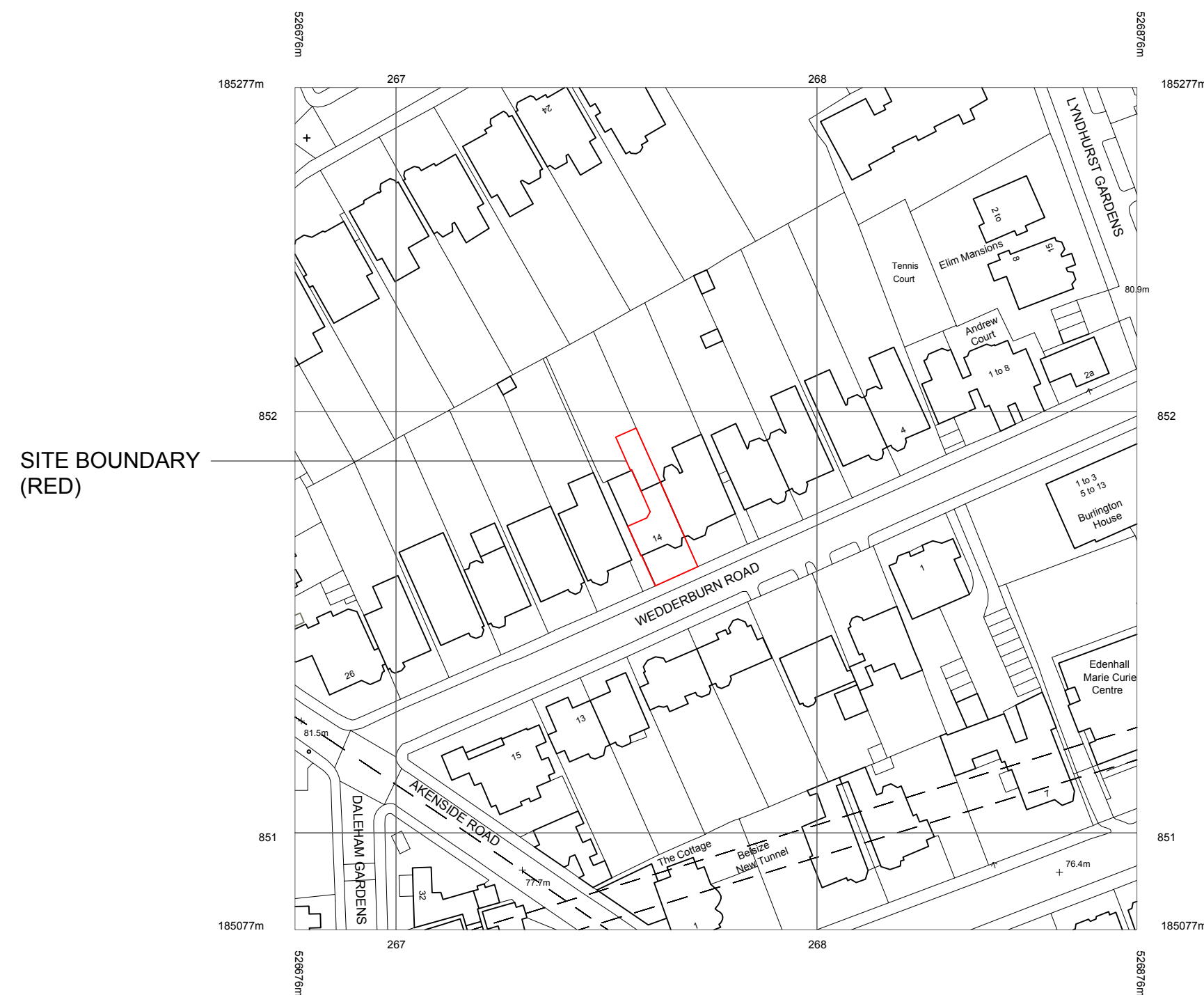
1 LOCATION PLAN SCALE 1:1250

Stanfords VectorMap © Crown copyright and database rights 2020 OS 100035409 Reproduction in whole or in part is prohibited without the permission of Ordnance Survey.