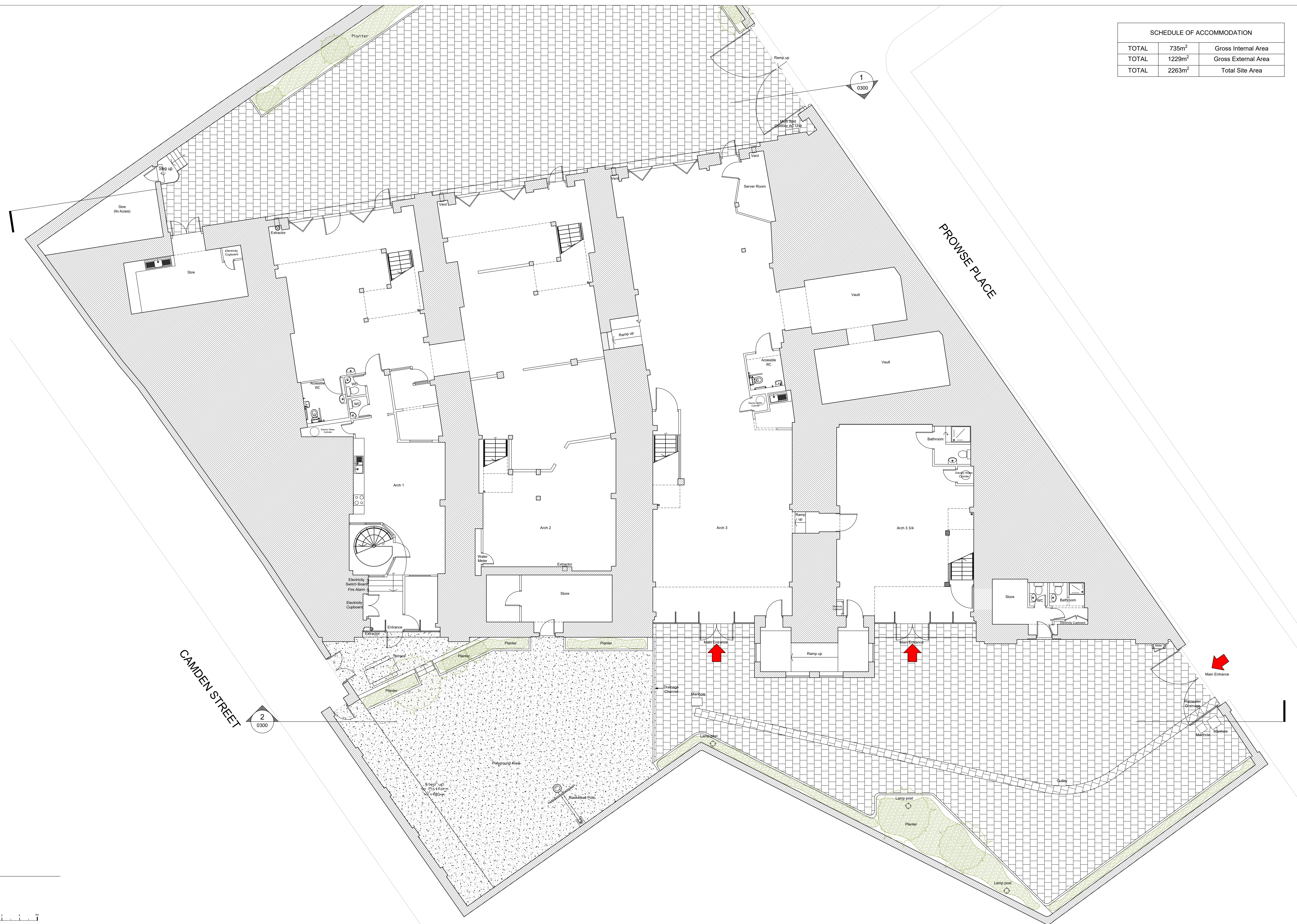
1 Ground Floor Plan_Existing 1:100 @ A1