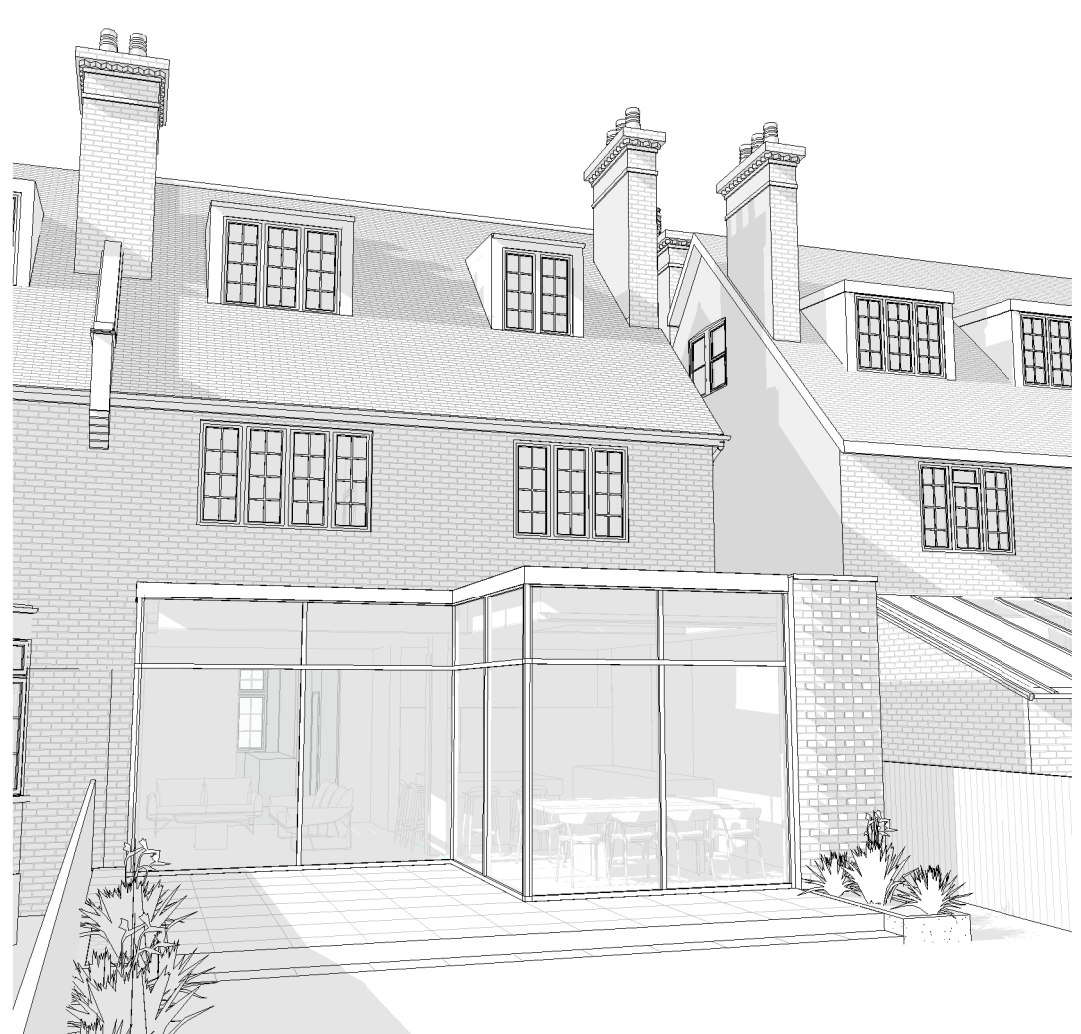
4 Proposed 3D View