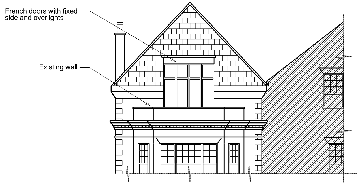
03 EXISTING REAR ELEVATION