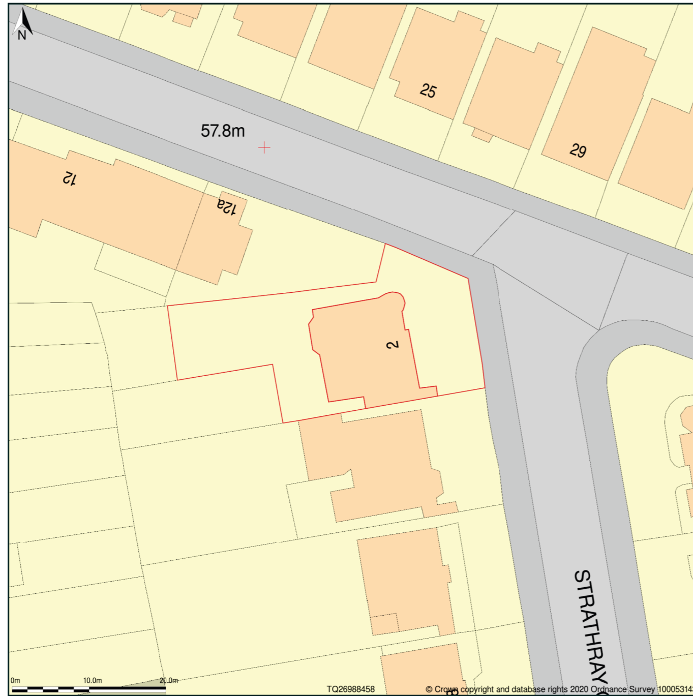
01 BLOCK PLAN 1:500@A3