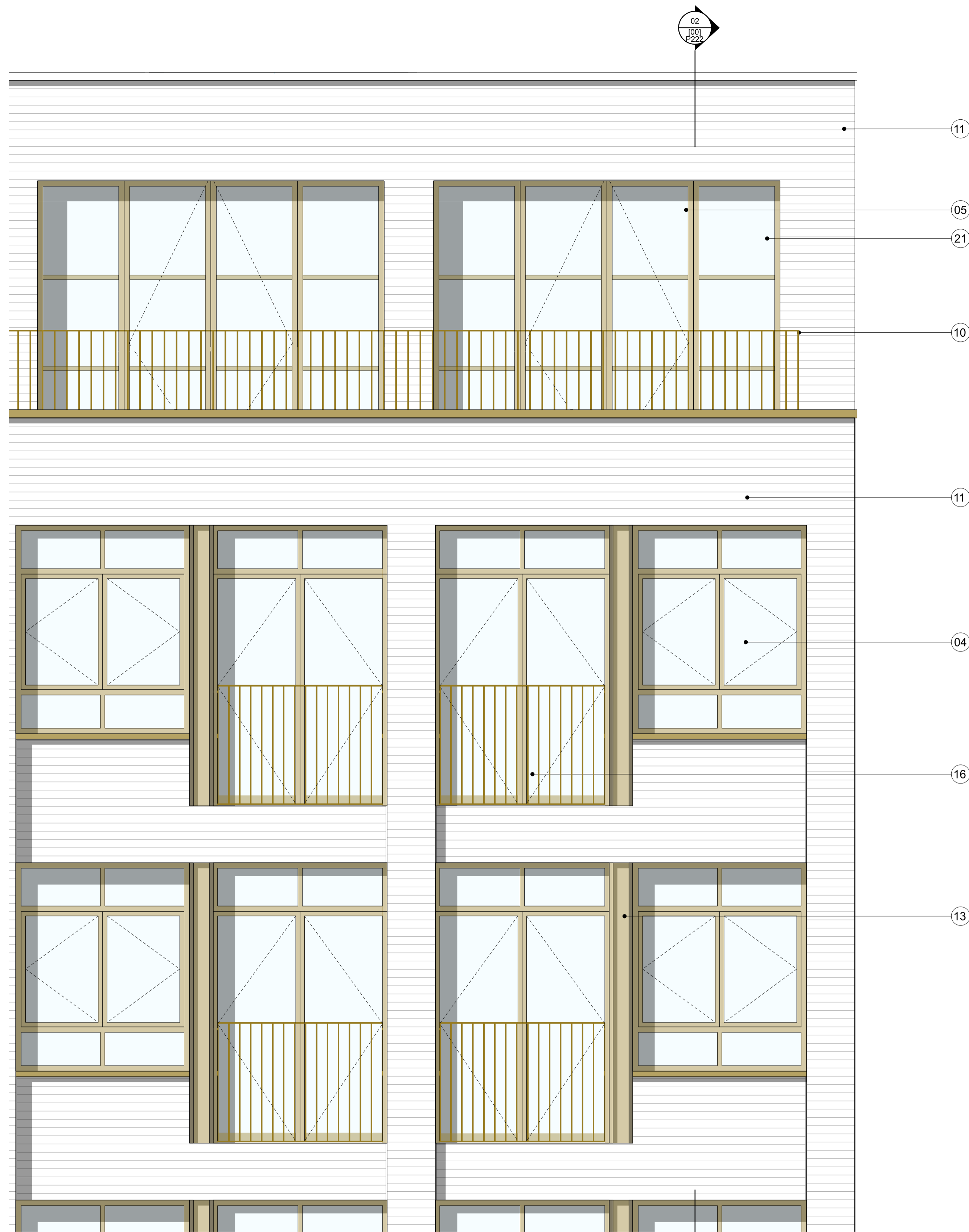
01 BAY ELEVATION: EAST ELEVATION UPPER