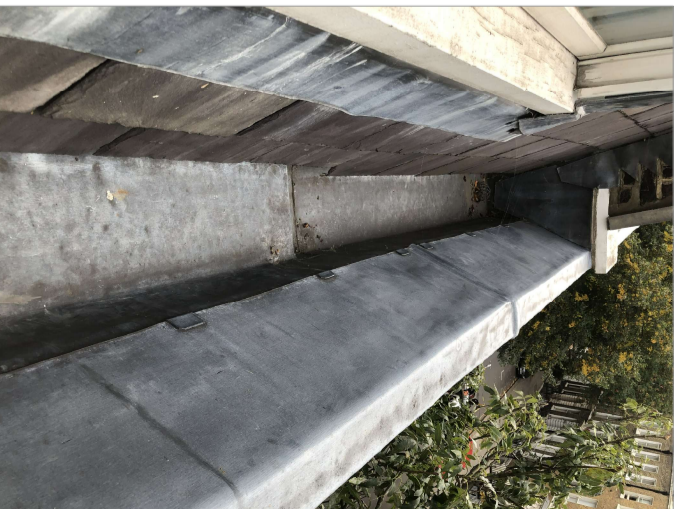
Photograph 2: Existing front elevation box gutter where proposed overflow pipes will penetrate.

Proposed lead overflow pipe (50mm diameter) penetrating through parapet wall. These 2no. overflows will provide the early warning should the parapet gutters block in the future. Pipe to be painted white and cut back 45 degrees.