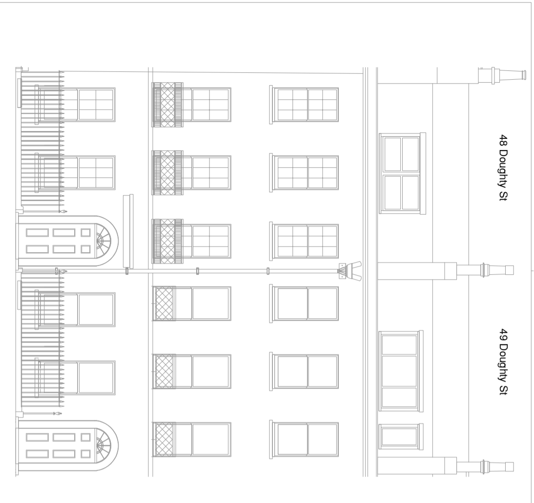
Existing Front Elevation (1:100)