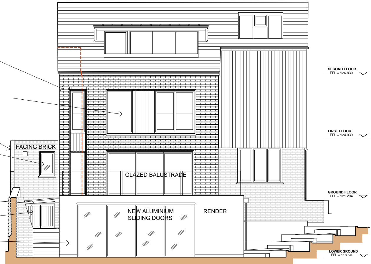
WEST ELEVATION 1 1:100 @ A3 HLW-P2-300

CONSENTED ALTERATION TO FENESTRATION & CLADDING CAMDEN REF. 2019/4427/P