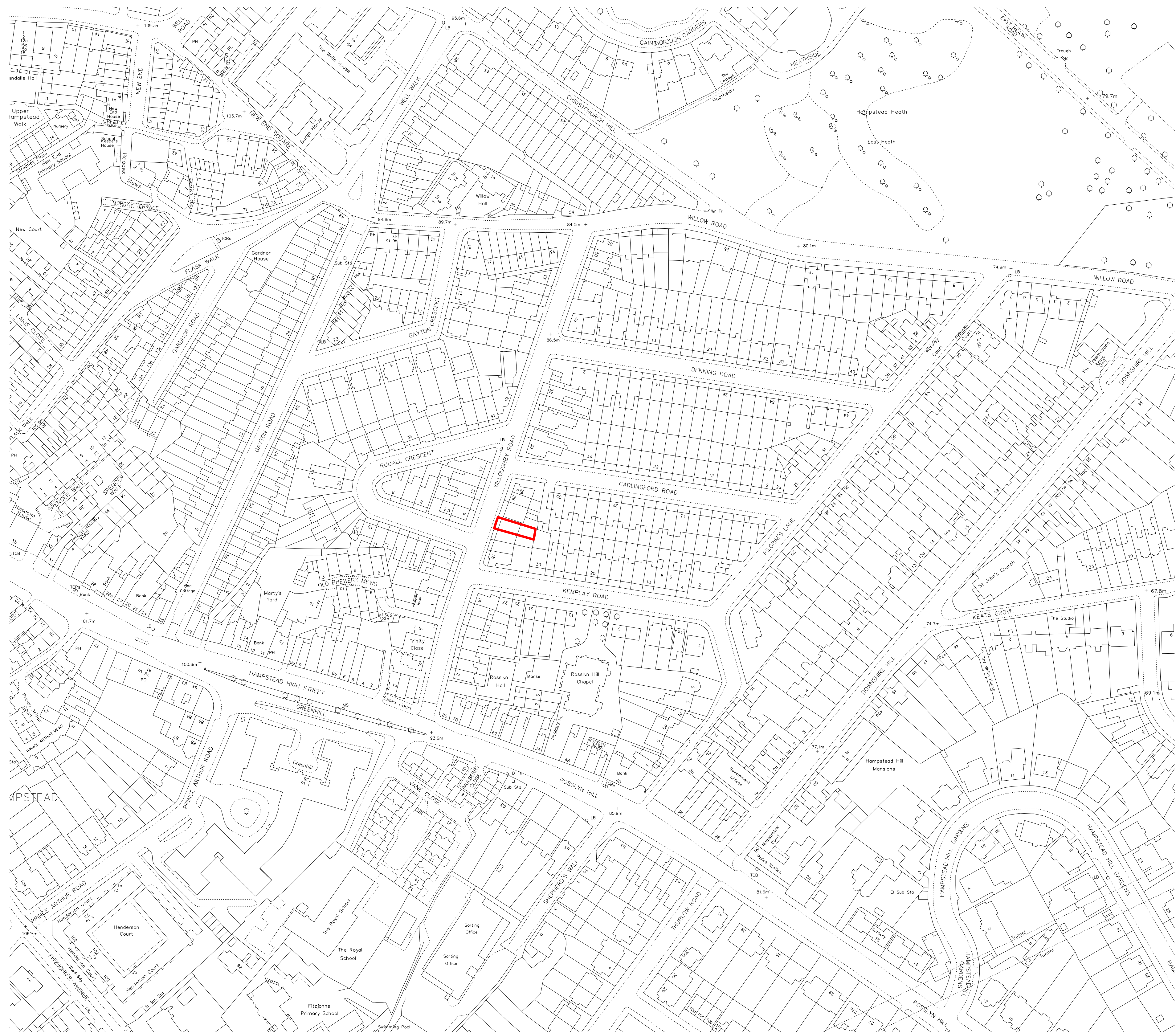
LOCATION PLAN (1:1250 @ A1)