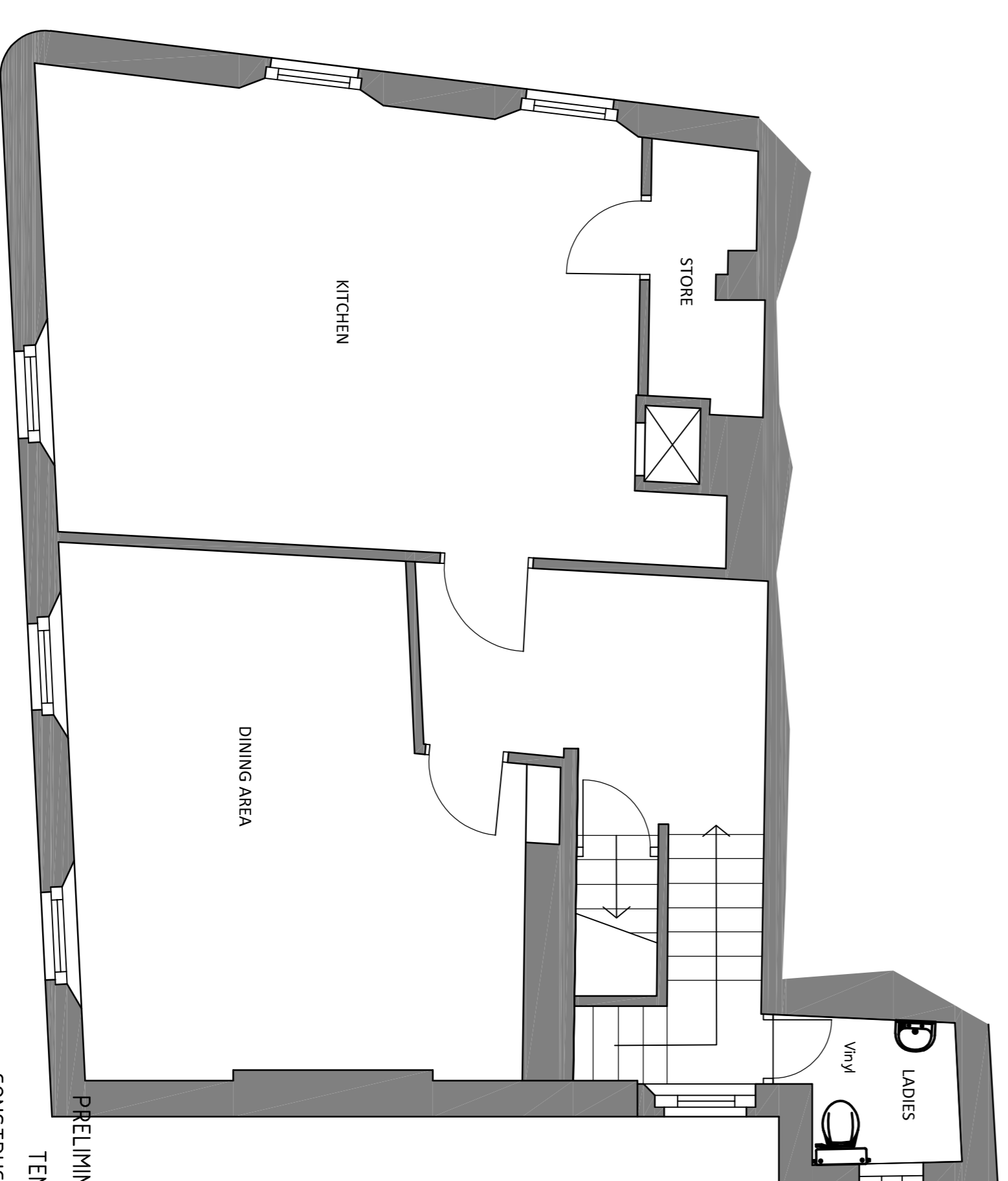
PROPOSED FIRST FLOOR PLAN scale 1:50