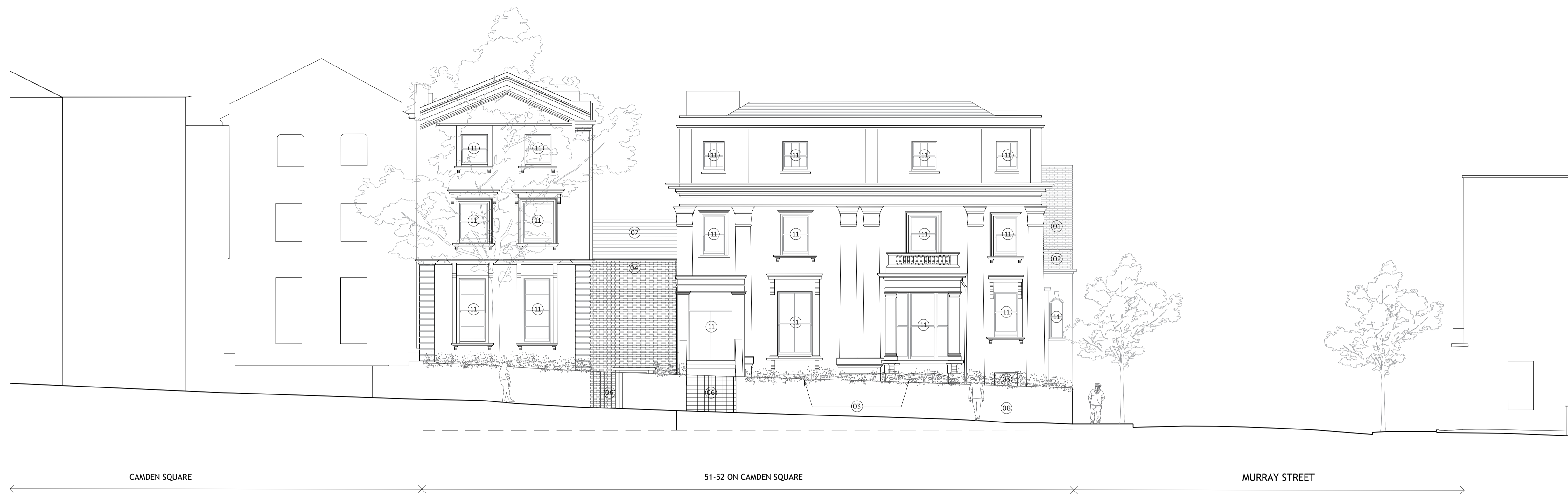
01 PROPOSED WEST ELEVATION CAMDEN SQUARE