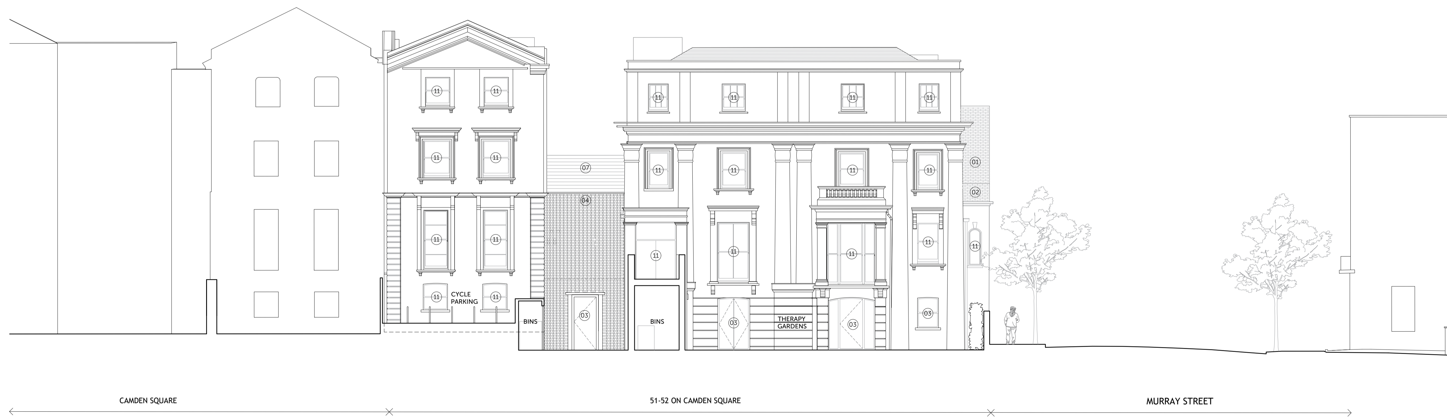
02 PROPOSED GARDEN SECTION CAMDEN SQUARE