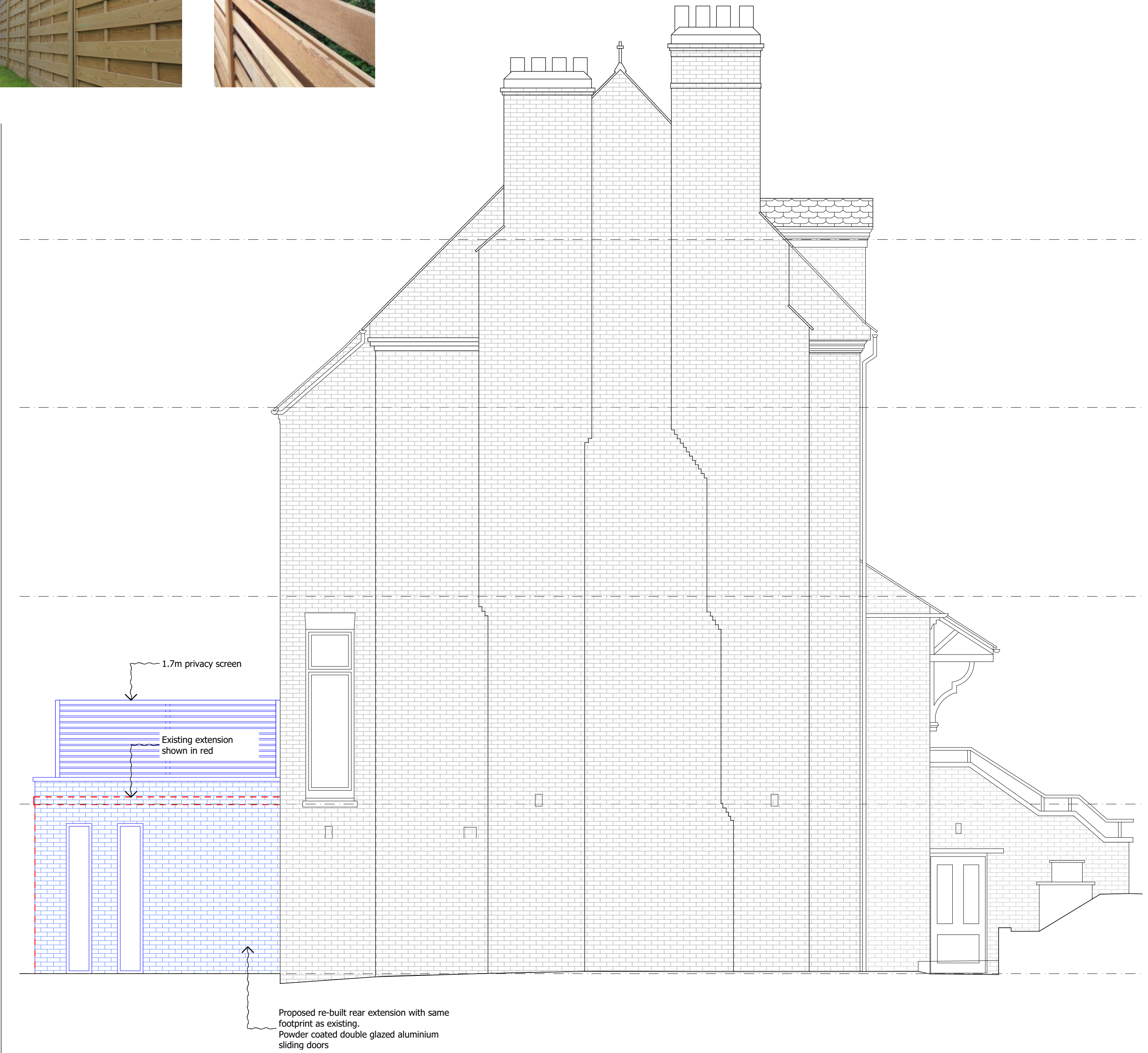
1 SCALE 1:50 @ A1, 1:100 @ A3 PROPOSED - SIDE (SOUTH) ELEVATION