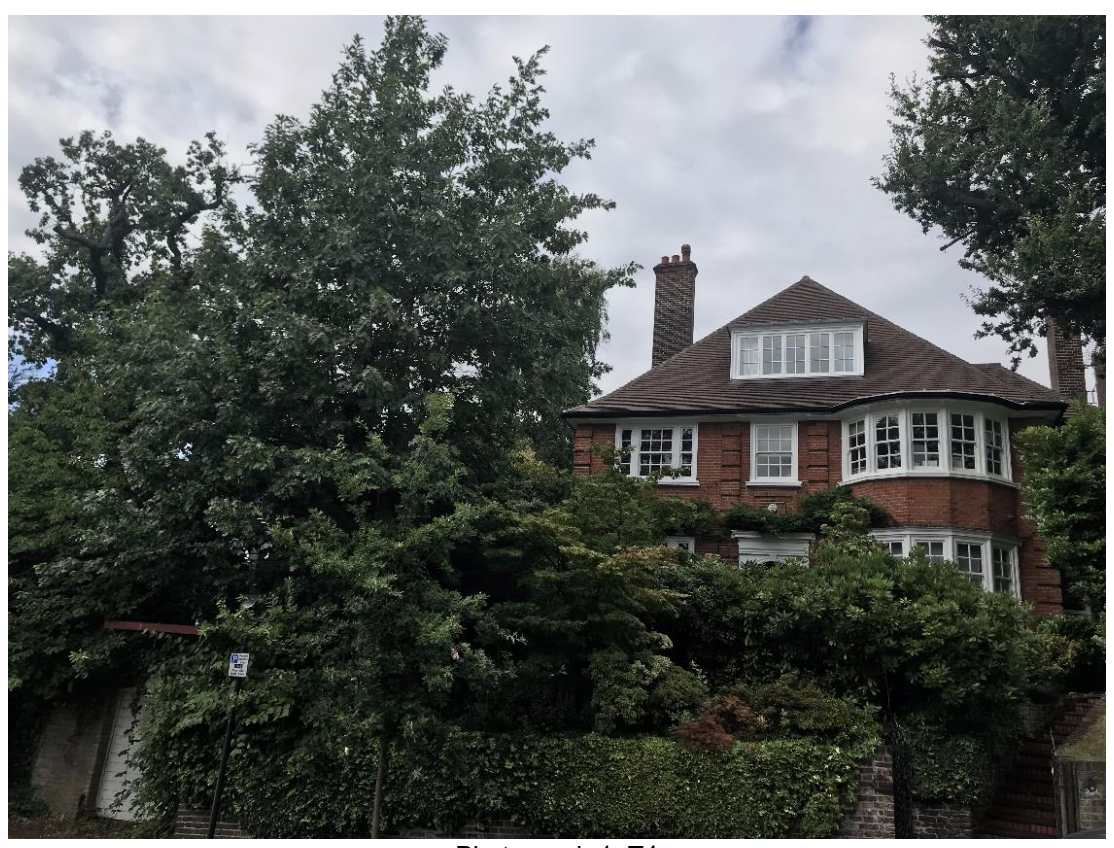
Photograph 1: T4

Web: www.landmarktrees.co.uk e-mail: info@landmarktrees.co.uk