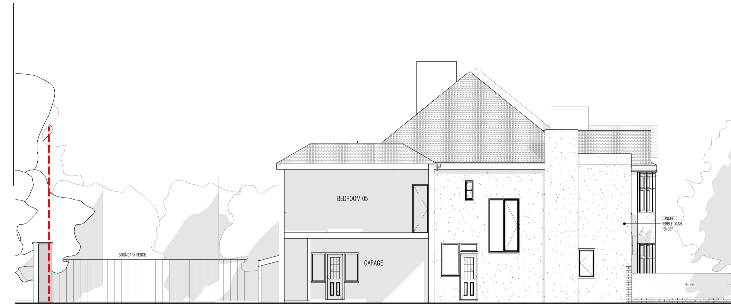
2 EXISTING WEST ELEVATION 001 1:100