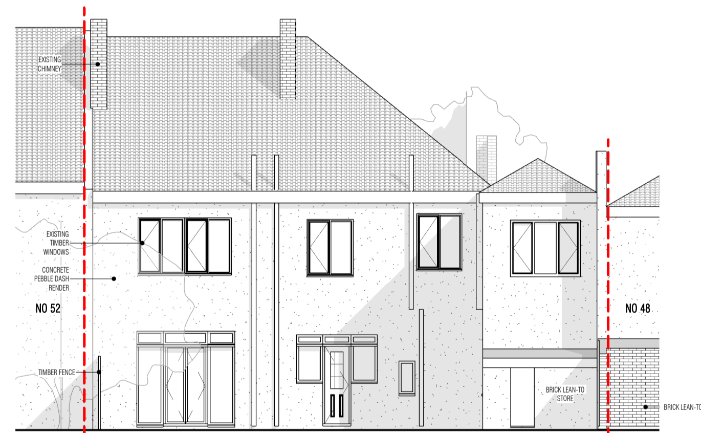
3 EXISTING NORTH ELEVATION 001 1:100